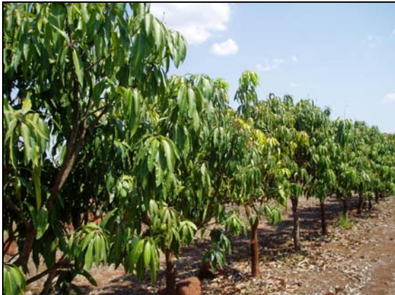
Figure 1. Poor fruit set at EAM – October 2005