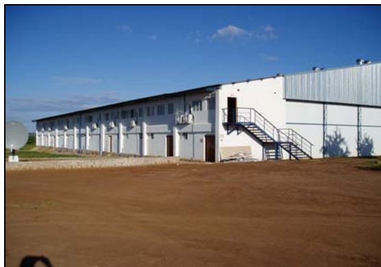
Figure 5. Vanduzi pack house, Manica Province

The assessment regarding Vanduzi is that there has been a relatively poor performance in the recent past as to pack-house throughput. The pack house is severely underutilized and there are plentiful signs of significantly high overheads in the form of capital stock and administrative staff. Our impression was that there had been a sweeping change in top management with a view to aggressively developing high volume throughput in the pack house (figure 5).