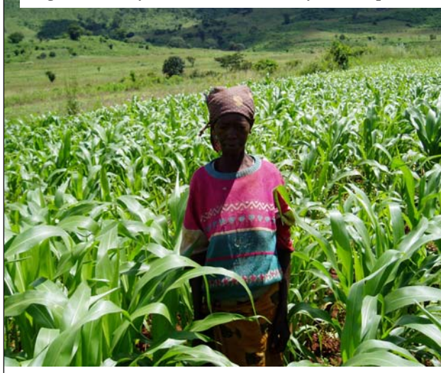
Figure 6. Family sector farmer with baby corn crop