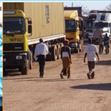
Cargo destination Mali