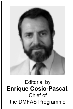
Editorial by Enrique Cosio-Pascal , Chief of the DMFAS Programme

Four countries, in 1981, formed the initial pool that allowed the development of the first DMFAS version. The development of a CBDMS is a complex matter, for many reasons. Let me give only two major examples here. First, each creditor has its own methodology to calculate accrued interest, fees and rounding for the