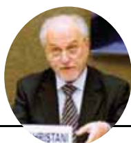
Ali al-Shahristani, Deputy Prime Minister for Energy Affairs, Iraq

“There is broad acceptance that volatility in the oil market in the past three years was driven by speculation and not by market fundamentals.”