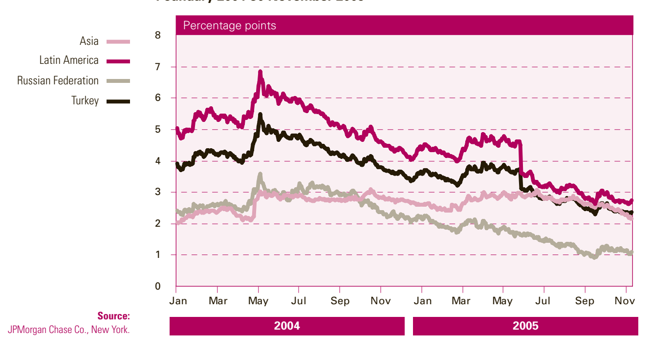
Figure III.1. Yield spreads on emerging market bonds, 1 January 2004-30 November 2005