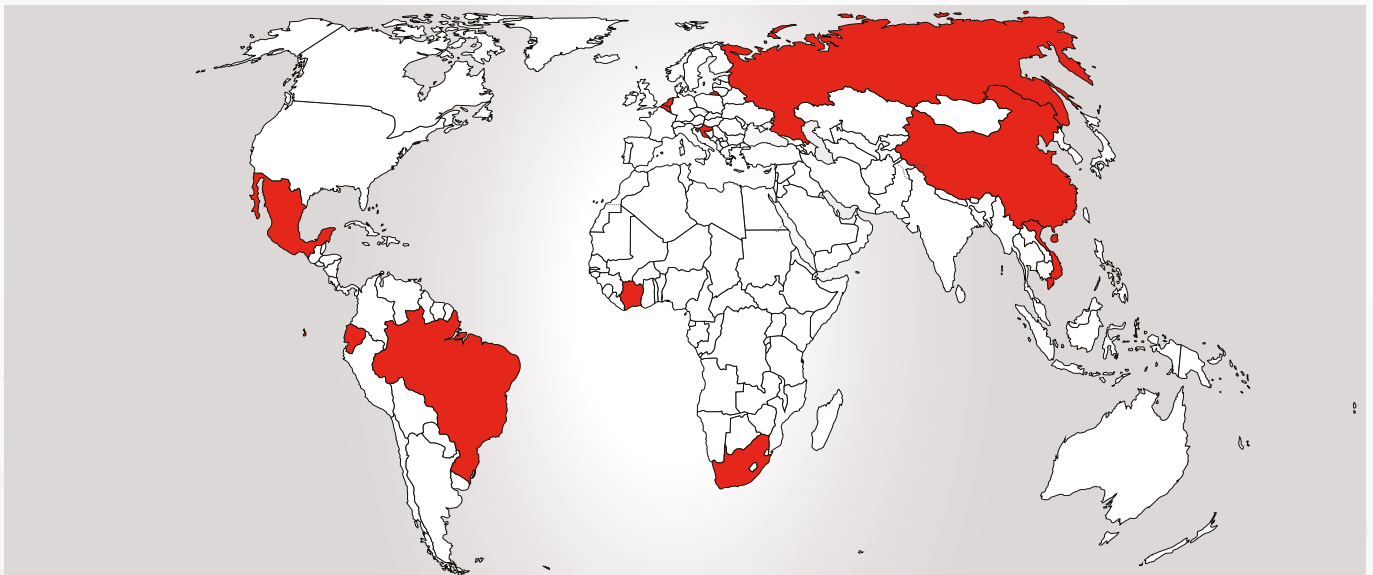
Countries assessed with the Accounting Development Tool, 2012–2014

Past: Association of Chartered Certified Accountants (United Kingdom), the Netherlands Institute of Chartered Accountants, Deloitte, KPMG, Ernst and Young, Pricewaterhouse Coopers and FBK, Ministry of Finance of Côte d'Ivoire, Ministry of Finance of Ecuador