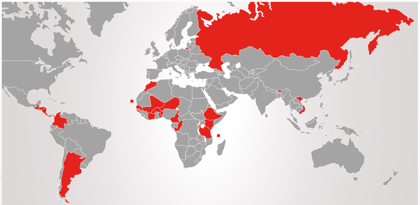
Business facilitation systems in place, by country

Current: Self-financing by some user countries, Germany, Luxembourg, the Netherlands, Switzerland, European Commission, One United Nations Fund Past: France