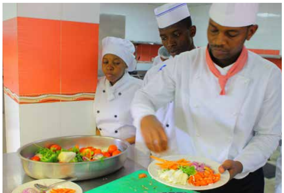
Students in training at the National College of Tourism

The Feasibility Study suggested the bio gas system to be in two solution phases. The first phase is to be an inexpensive, locally procured solution to address the immediate needs. This bio gas facility installation is to be covered under project's Exit Phase. A more state-of-the art solution, to be accomplished once funding becomes available i.e. bio gas facility installation 'Phase II'. In this scheme, if Phase II installation is implemented, the Phase I installation will be used as a back-up system.