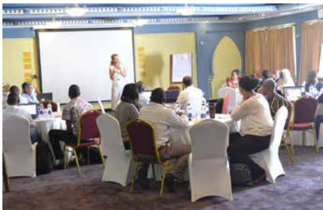
Participants at the RTTZ Responsible Tourism Workshop

and had a high turnout of key public and private sector stakeholders. The meeting was chaired by the new Permanent Secretary (PS) in the Ministry of Natural Resources and Tourism and was also attended by the PS from the Vice President's Office. Participants included most key tourism stakeholders from the public and private sector. The event included sessions and debates on specific issues such as tourism sector employment regulations (updates on work permits, labour laws and worker visa requirements), Environmental Impact Assessment requirements for tourism facilities and activities, town and country planning ordinance and impact on tourism stakeholders, updates on the