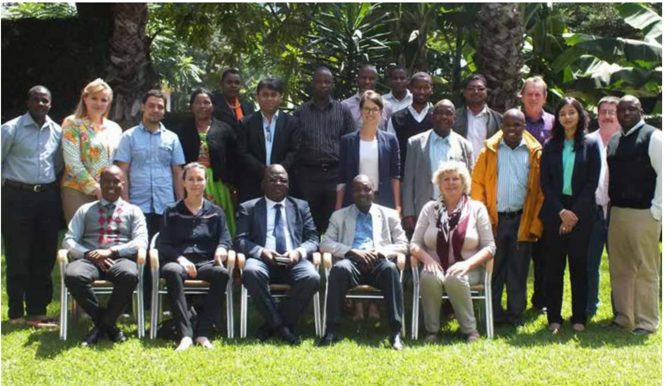
Participants at the Buyer Requirements Validation Workshop, Arusha, Tanzania, June 2016

- Improved impact on relevant Government policies by TAHA, such as on VAT exemption, skills development, fertilizer regulation, etc.