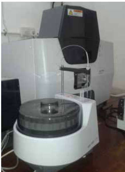
High quality Shimadzu AAS and Auto Sampler equipment now installed at TIRDO