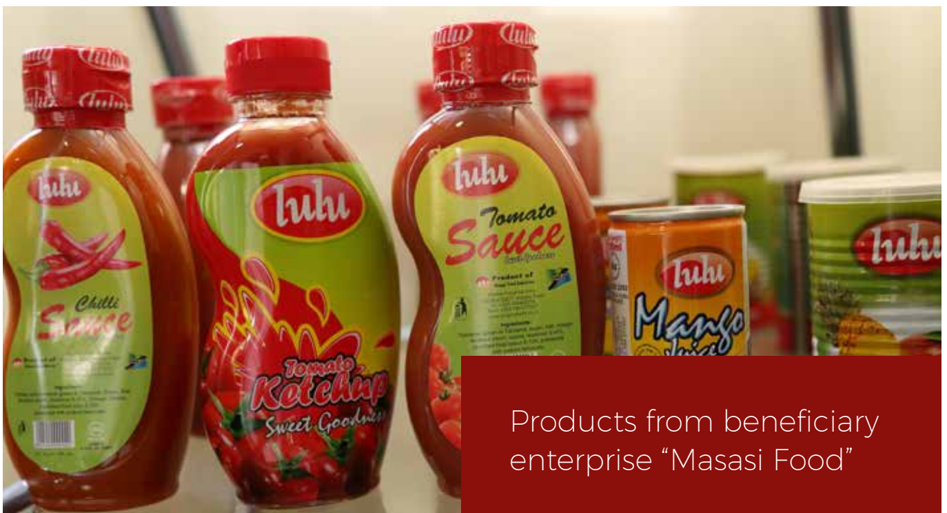
Products from beneficiary enterprise "Masasi Food"