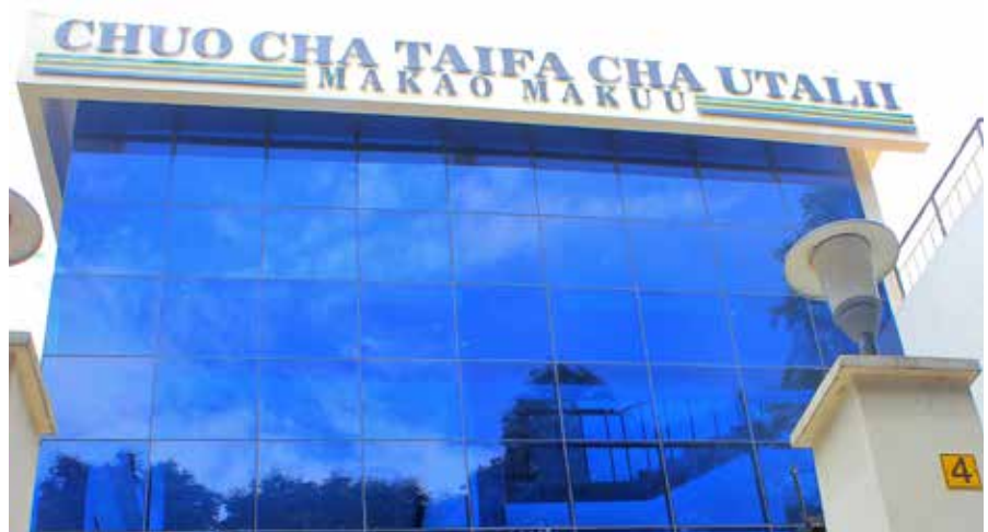
National College of Tourism, Bustani Campus, Dar es Salaam