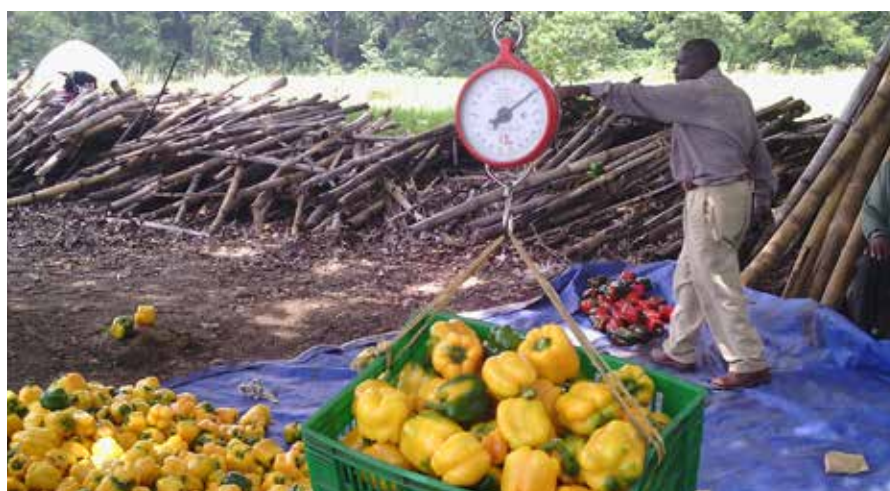
Sorting at Tengeru

Dodoma: Dodoma received six greenhouses and production started around November 2016, average sales till today being 60 kg of pepper, 150 kg of lettuce and 550 kg of tomatoes per week. The six greenhouses are managed by a group of youth belonging to the SUGECO and located in Dodoma. They are supplying fresh produce to hotels and restaurants e.g. Morena Hotel, Saint Gaspar Hotel, Nashosa Hotel and Alpha Supermarket. They have steadily been receiving more orders to supply more products, with a recent order for 560 kg per week requested by the Agro-for Help Foundation and three local restaurants.