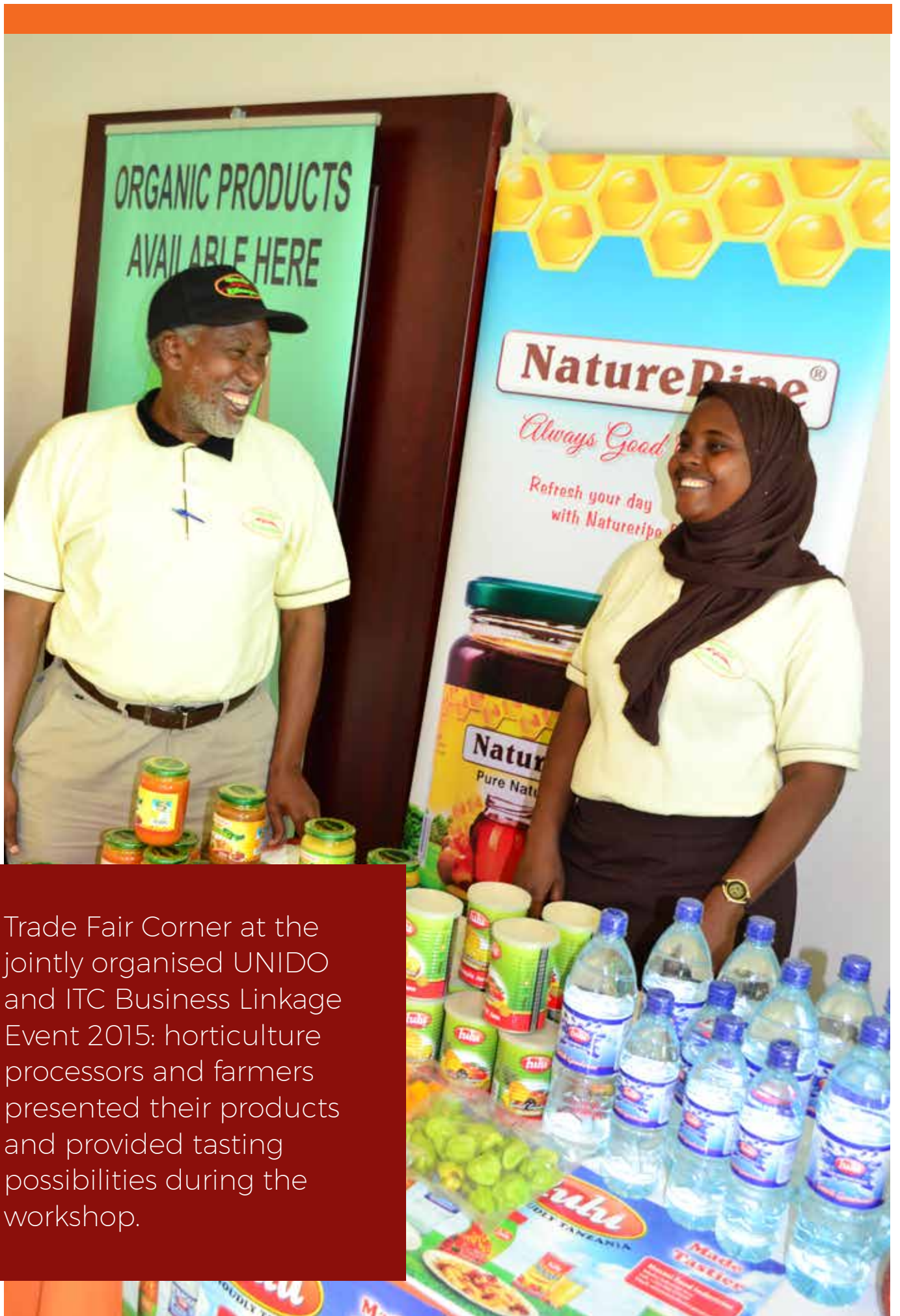
Trade Fair Corner at the jointly organised UNIDO and ITC Business Linkage Event 2015: horticulture processors and farmers presented their products and provided tasting possibilities during the workshop.