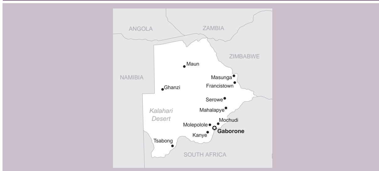
Figure 1. Map of Botswana