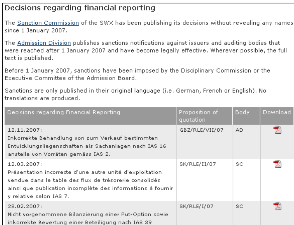
Table 4. No-name decisions (excerpt)

67. Some erroneous applications of IFRS between the end of 2002 and the end of 2007 that led to sanctions are shown below. 14