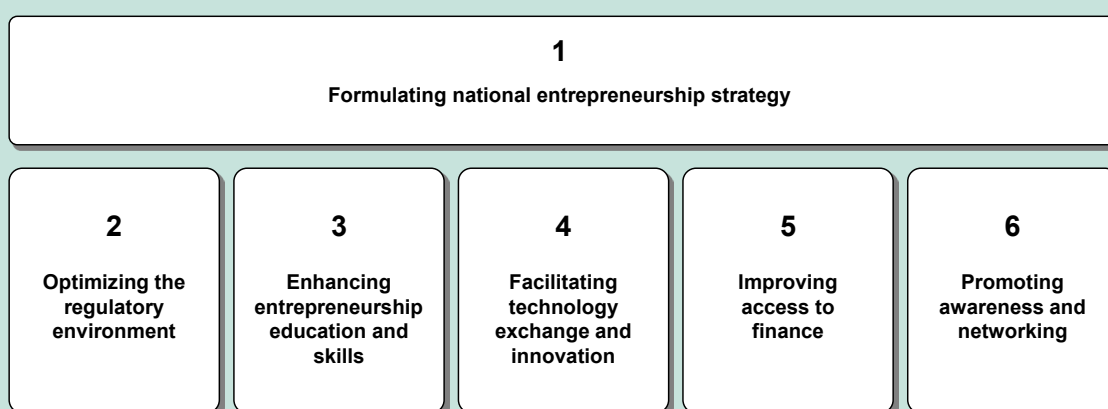
Box figure 1. Key components of UNCTAD’s Entrepreneurship Policy Framework

The EPF further proposes checklists and numerous references in the form of good practices and case studies. The case studies are intended to equip policy makers with implementable options to create the most conducive and supportive environment for entrepreneurs. The EPF includes a user guide, a step-by-step approach to developing entrepreneurship policy, and contains a set of indicators that can measure progress. An on-line inventory of good practices in entrepreneurship development, available on UNCTAD’s web-site, completes the EPF. This online inventory will provide an opportunity for all stakeholders to contribute cases, examples, comments and suggestions, as a basis for the inclusive development of future entrepreneurship policies.