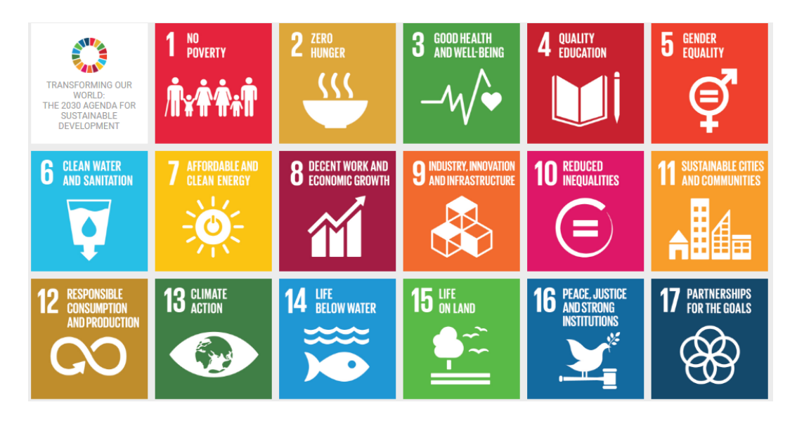
Figure 1: SDGs

Science, Technology, and Innovation (STI) is essential to achieve 17 Sustainable development goals (SDGs) including poverty, hunger, and inequality reduction, climate change, clean water and energy, and health and education improvement . Based on the CSTD secretariat request for answering three questions about the experience of CSTDs member countries in implementing new innovation approach to achieve SDGs, here is elementary brief report about Iran experience.