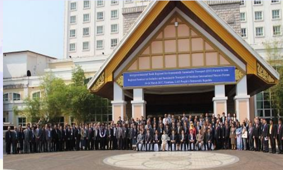
Intergovernmental Tenth Regional Environmentally Sustainable Transport (EST) Forum in Asia 14 - 16 Mar 2017 Vientiane, Lao PDR. Theme: 2030 Road Map for Sustainable Transport ~Aligning with Sustainable Transport Development Goals (SDGs)