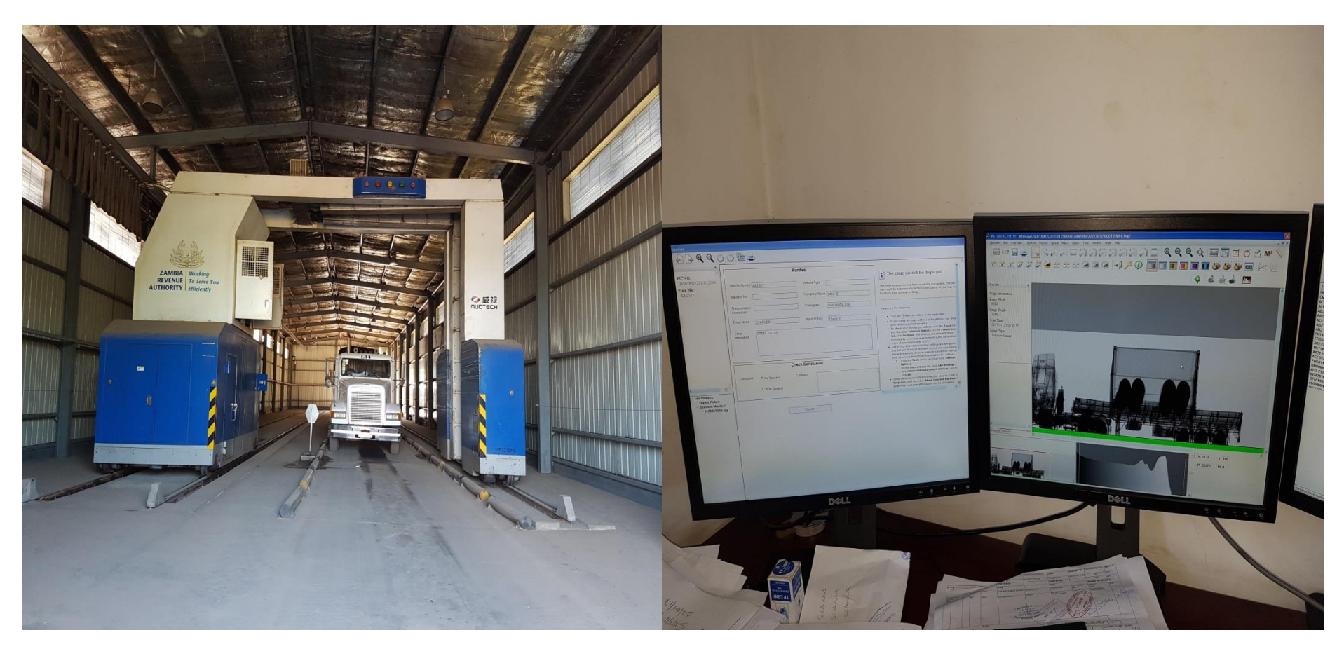
Fixed Non-Intrusive Equipment (Scanners)