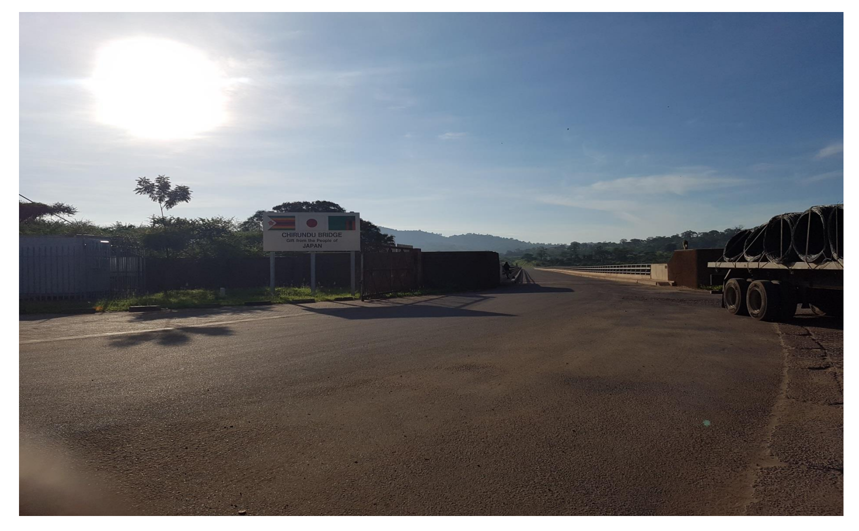
New Chirundu bridge connecting the two OSBP facilities