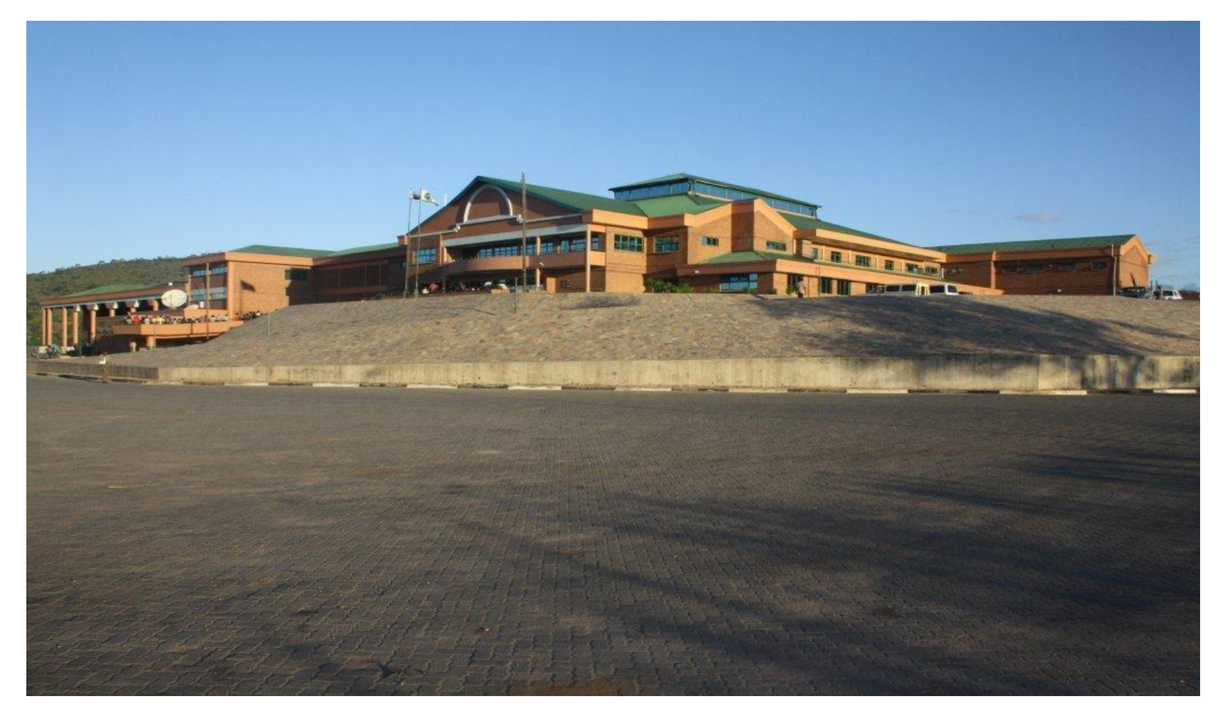
New Chirundu OSBP Border facility; Zimbabwean side