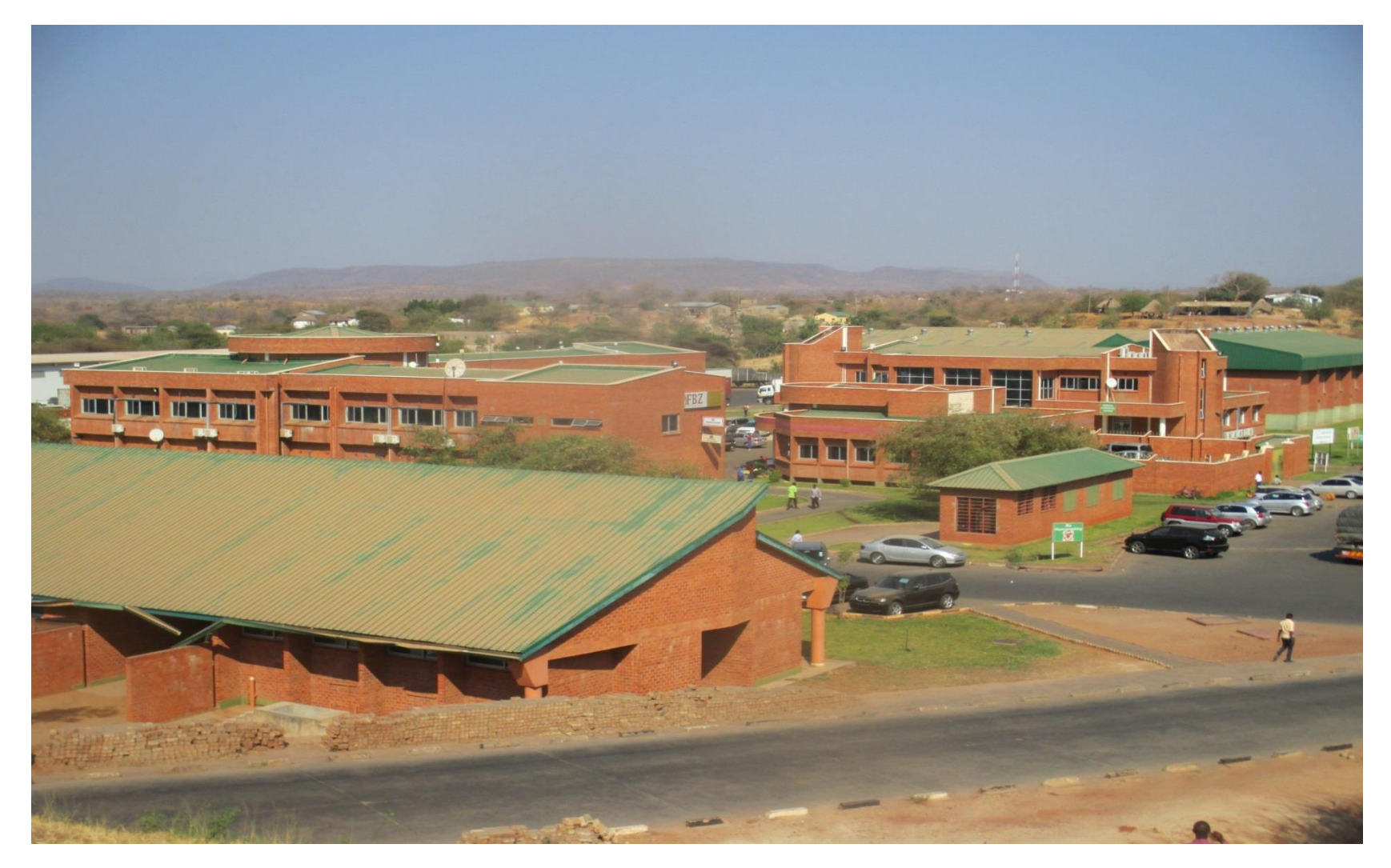
New Chirundu OSBP Border facility; Zambian side