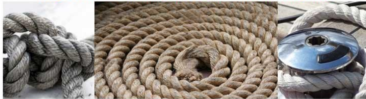
Gestão Moderna dos Portos - Gestión Moderna de Puertos