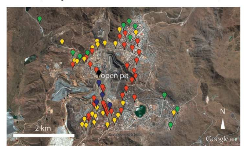
The Ayapoto area mentioned in the main text is located immediately to the west of the open pit. The coloured markers indicate the concentration of lead in soil: green, \leq 400 mg/kg; yellow, > 400–1200 mg/kg; red, > 1200–5000 mg/kg; blue, > 5000–10 000 mg/kg; black, > 10 000 mg/kg.