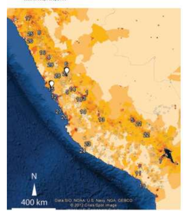
Fig. 1. The 312 sites' with active mining operations or mining legacies associated with lead in soil. Peru. 2009