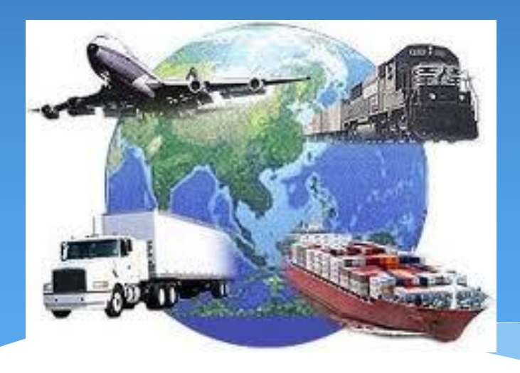
FIATA documents are multimodal native