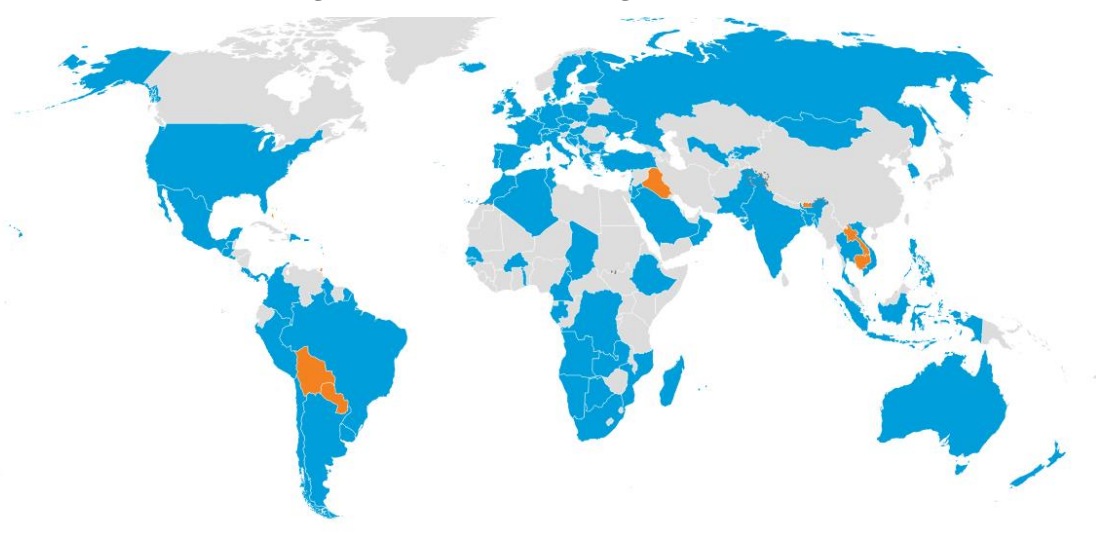
Figure 1 Countries with non-governmental consumer organizations and associations*