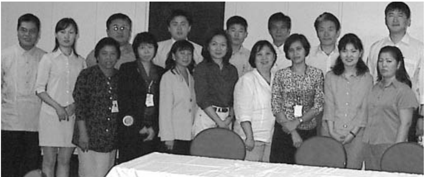
Mongolian delegation to Manila study tour on DMFAS at the Bureau of Treasury

The workshop, which was organized in the context of Pôle Dette's regional capacity-building initiative, had four objectives: