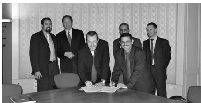
Signing of project document, Central Bank of Algeria and UNCTAD.

UNCTAD's project with the Central Bank of Algeria is aimed at reinforcing the latter's debt management department. It will focus on transferring data from the Central Bank's present own-