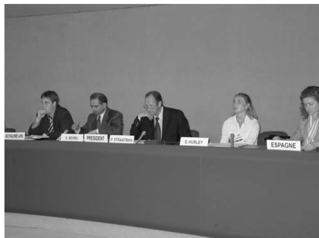
Conference panel on additional debt relief, which included representatives from (left to right): UK, World Bank, UNCTAD, EURODAD and Spain.

DMFAS activities for the period 2002-2005 was also presented. Based on the report, the Programme will present its new strategic work plan to existing and potential donors in a donors meeting, which will be organized in 2006. The donor meeting will determine the funding for a new multi-year, multi-donor trust fund, which will be established in 2006. During the Advisory Group meeting, Norway already reaffirmed its commitment towards future financial support.