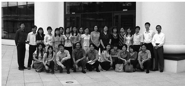
Vietnamese workshop on debt statistics.