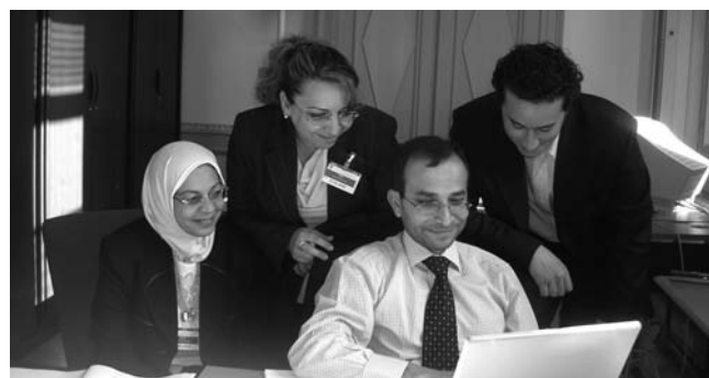
Representatives of the Central Bank of Iraq and Ernst and Young at an UNCTAD IT workshop in Geneva.

UNCTAD will continue to provide technical assistance to the Iraqi Government through additional training and advisory services, which will be subject to a separate cooperation agreement.