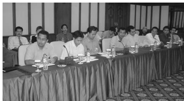
Participants at the statistics workshop in Indonesia.

Both Bank Indonesia and the Ministry of Finance have installed the DMFAS system and have up-to-date comprehensive databases. These provided the inputs for the Debt Statistical Bulletin. In the specific case of Bank Indonesia, it has only recently started using the DMFAS system, after two decades of using an in-house system. On the other hand, the Ministry of Finance has been using the DMFAS for monitoring government external debt since 1989.