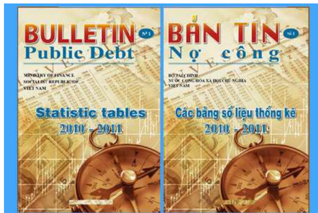
Cover of the 1st Public Debt Bulletin of Vietnam

Building on the success of previous projects with the DMEFD, the latest project, implemented in 2011-2012, included the installation of DMFAS 5.3 at the Vietnamese State Treasury (VST) which is in charge of managing domestic debt issuances. As a result, the domestic debt database was created and VST staff now use the system to follow-up and report on debt issuances. Support was also provided by DMFAS to the Vietnamese IT team to develop the interface between the Ministry of Finance's Treasury Accounting System and DMFAS.