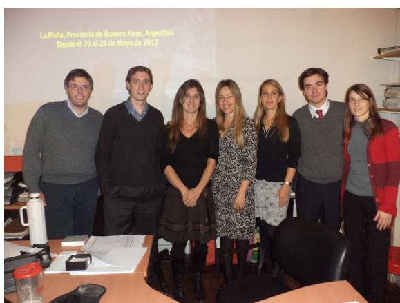
Participants at the data validation workshop for the Province of Buenos Aires and DMFAS User Representative

In the framework of the technical assistance Project "Strengthening public debt management capacity" signed with the Government of the Province of Buenos Aires, Argentina, a debt data validation workshop was organized in May in La Plata, Argentina.