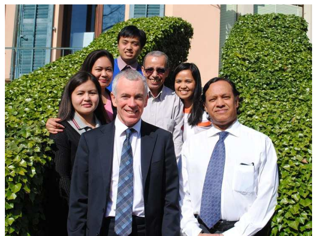
Delegation of the Philippines and DMFAS staff during the DMFAS 6 training of trainers in Geneva

One of the most important components of the project is the enhancement of BTr's human resource capacity. This will reinforce the BTr's capacity as it strengthens its debt and risk management office. The component encompasses several types of activities: study visits, training of trainers, attendance to courses and seminars, and focused training targeted at specific skills. Study visits have been completed in Argentina, Brazil, Czech Republic, Hungary, Indonesia and Turkey. Two training-for-trainers workshops were held in September 2013 and March 2014 at UNCTAD headquarters, and these trainees will train their fellow colleagues in May 2014. BTr officials have also participated in several debt management conferences, including the UNCTAD Debt management conference in November 2013, the Daiwa conference in Tokyo, and the Government Bond Market conference in Romania. A series of national Oracle training activities are also being conducted on IT and on finance.