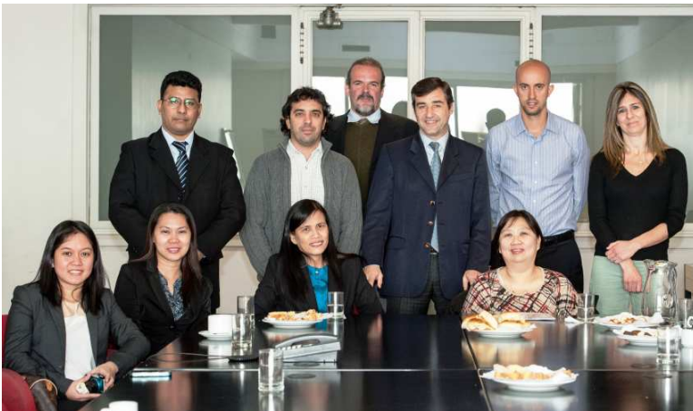
Delegation of the Philippines in Argentina during the study tour at the Oficina Nacional de Crédito Público

In 2010, the BTr and UNCTAD entered into an agreement for UNCTAD to provide comprehensive support in several areas including institutional and organizational reform, comprehensive human capacity development, strengthening of the analytical and risk management functions and implementation of DMFAS in the BTr. The current project started in March 2011, and is in the final year of a four-year project-life. The project is coordinated by a Project Steering Committee (PSC), comprising the Treasurer of the Philippines, a Deputy Treasurer of the Philippines and the Chief of the DMFAS Programme. The PSC meets regularly to provide strategic direction and review implementation of activities. Five sub-project teams have also been created to implement different components of the project. In order to support the execution of activities, the project is also assisted by a number of dedicated personnel - a National Project Officer, based in the Philippines, and an Administrative Assistant, based at UNCTAD Headquarters - as well as a Project Manager, consultants and other resource persons.