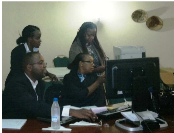
Participants at the DMFAS 6 Basic functional training

The project activities started in February 2014 with the merging of both databases and the successful conversion to DMFAS 6. The new database was installed in Zambia in March and first level training was provided to both institutions. Future activities include advanced training on DMFAS 6, workshops on data validation, debt statistics and debt portfolio analysis and also the building of an interface between DMFAS and the integrated financial management information system (IFMIS).