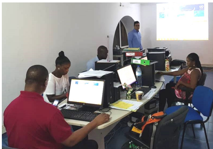
Specialized DMFAS training, August 2018, Bissau

Capitalizing on the knowledge gained during the first activities, the conditions are now favorable for strengthening the Middle Office's capacity by holding workshops on methodologies and tools on debt statistics and debt analysis to publish a debt statistical bulletin and a debt portfolio analysis review. These activities, planned for the end of the year, will complement successful efforts made to date to improve operations related to DMFAS debt database management.