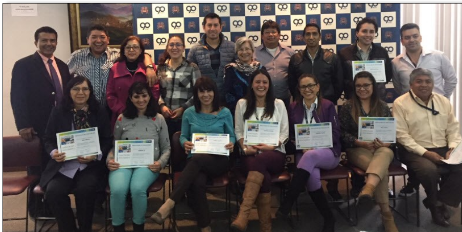
Advanced functional training in Quito, June 2018

Both databases have been converted from DMFAS 5.3 to DMFAS 6 and 35 users from both institutions have been trained in the basic and advanced use of DMFAS 6. Since the end of the previous project in 2007, important organizational and staff changes had taken place. Therefore, the Ministry deemed a thorough data validation was necessary. This took place after the advanced training with the help of a DMFAS consultant. Moreover, the MEF requested further capacity building activities on debt statistics and debt analysis, so the new staff can be trained thoroughly. UNCTAD looks forward to further strengthening the cooperation with both the Central Bank and the MEF, beyond the project.