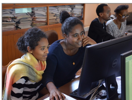
Participants at the advanced functional training

Eritrea is the latest country to adopt DMFAS version 6. The Ministry of Finance (MoF) recently completed the recording of its database of government's liabilities.