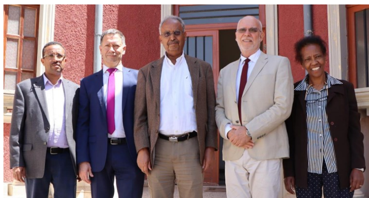
From left to right: PFM Unit Coordinator, DMFAS Project Manager, Minister of Finance of Eritrea, DMFAS Consultant and Treasury Director General