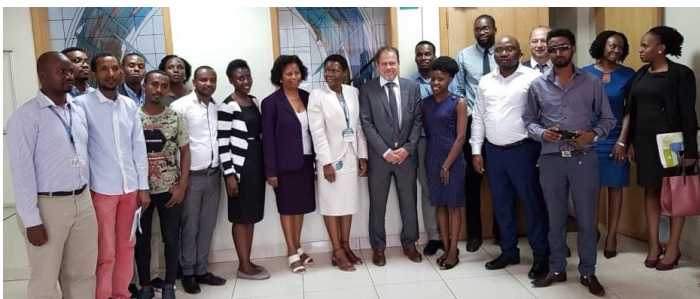
Debt officers from Eritrea and Uganda with DMFAS experts, Kampala, March 2019

In particular, UNCTAD's training helps countries to understand these guidelines, to better define the content, presentation and frequency of their debt statistical data, and to assist debt officers in producing and selecting appropriate statistical tables (within DMFAS) and reporting periods for their own debt statistical bulletins.