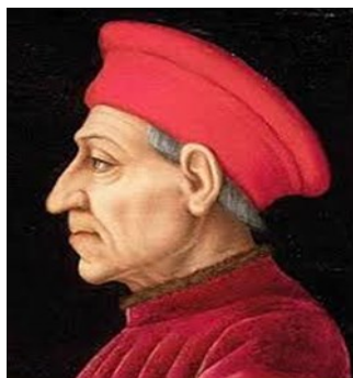
Cosimo de' Medici, Founder of the Medici Bank

As a final thought, it's interesting to note the origin of the word "bank" which is derived from the Italian banca. The literal meaning of banca was the "bench" where money changers used to transact business. The term was later used to describe the shop itself. Banca rotta (from which we obtained the term "bankruptcy") is simply a broken bench!