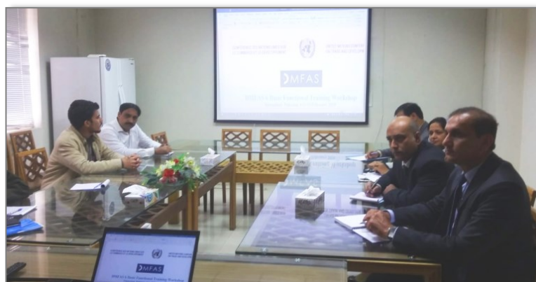
Basic functional training in Islamabad, January–February 2019

the project, which started late 2018 will end in June.