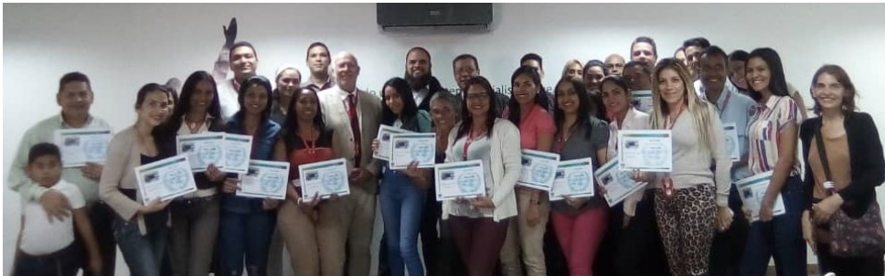
Participants at the DMFAS training in Caracas, May 2019

This article was prepared by the NOCP for the DMFAS newsletter