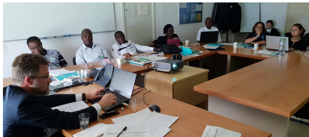
Participants during the PPP workshop in Geneva

d'Ivoire explored debt management concerns with PPPs. The group discussed key topics including risk allocation, stakeholders mapping, and project monitoring. Producing information and systematizing it is key for identifying risks and monitoring them for timely action and creating sound policies by the authorities.