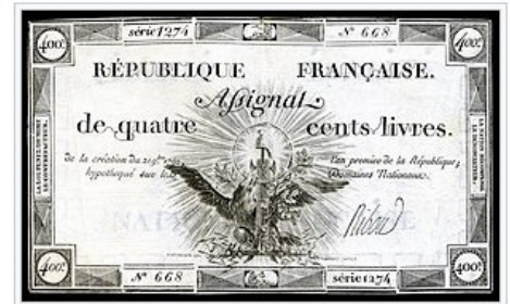
Assignats from the 1792 issue: 400 livres

Initially meant as bonds, the assignats were redefined as currency by the National Assembly in April 1790 to address the liquidity crisis provoked by the instability of the