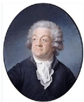
Portrait of Mirabeau by Joseph Boze (1789)

"Originally meant as bonds, the assignats were redefined as currency"