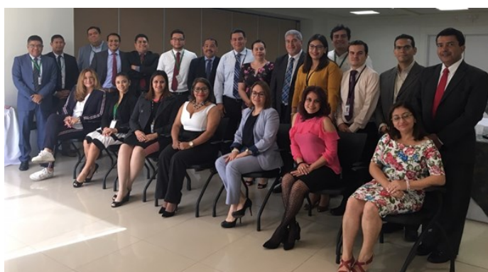
Experts from SEFIN, Central Bank and DMFAS in Tegucigalpa

“The workshop analysed ... how DMFAS could help in monitoring the potential fiscal risks”