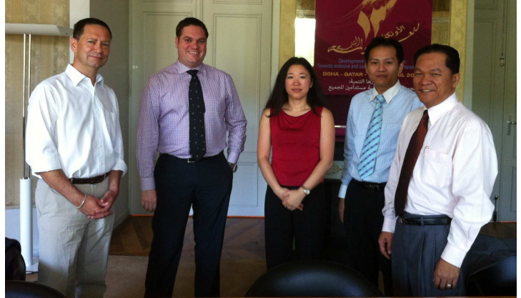
MoU signing ceremony in UNCTAD Headquarters

A delegation from the Cambodian Ministry of Finance and Economy (MEF) and the Asian Development Bank (AsDB) travelled to Geneva on 7-8 August 2012 to discuss the continuation of collaboration with UNCTAD on debt management. A Memorandum of Understanding (MoU) was signed between the three parties at the end of the mission. The current DMFAS 5.3 project in Cambodia came to an end in September 2012 with the organization of a debt portfolio analysis workshop (see below). The Cambodian delegation requested further assistance in DMFAS 5.3 advanced reporting as well as follow-up workshops on data validation and debt statistics. The upgrade to DMFAS 6 is envisaged within a framework of a new project possibly financed by AsDB, and preliminary discussions took place during the visit of the delegation as well as during the project evaluation mission in September 2012.