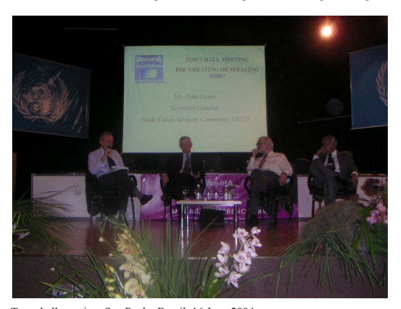
Town hall meeting, Sao Paulo, Brazil, 16 June 2004

The afternoon sessions on 16 June 2004 focused on programmes encouraging national firms to invest abroad. Public and private sector speakers from Europe emphasized the many benefits of outward investment for national companies and home country economies. It was also stated that outward IPAs play an important complimentary role vis-à-vis inward IPAs in facilitating the investment process and in providing aftercare.