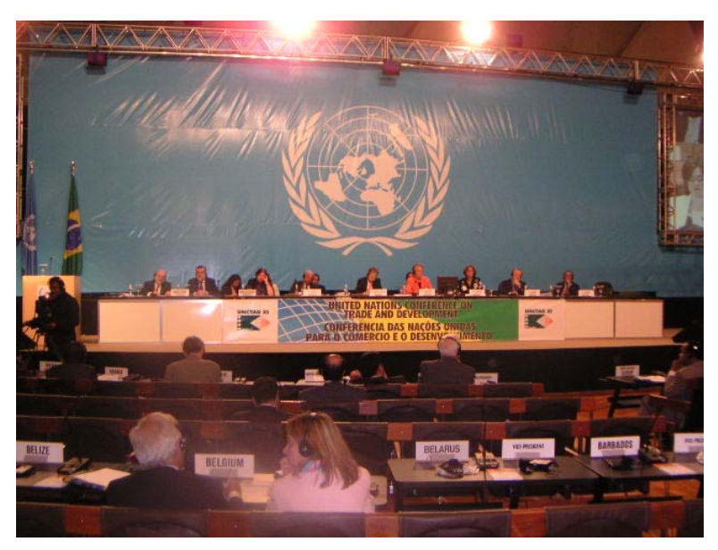
Joint UNCTAD/WAIPA High-level session, Sao Paulo, Brazil, 15 June 2004

The ninth Annual Conference of WAIPA was held in Sao Paulo, Brazil, from 15 to 16 June 2004 as a parallel event to the eleventh session of UNCTAD. As in the case of the Expert Meeting, the Conference was preceded by a two-day (13-14 June 2004) training workshop facilitated by Pro-Invest on "How to Promote and Target FDI into Tourism and Benefit from it". The main objective of the event was to develop an appreciation among participants from the ACP region of the role of tourism in generating sustained growth and of the nature, design and development of investment promotion strategies for attracting FDI into this sector.