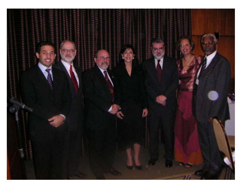
WAIPA Gala Dinner during the first day of the Conference, Sao Paulo, Brazil, 15 June 2004

A Gala Dinner sponsored by the Dubai Development and Investment Authority (DDIA) was organized on the evening of 15 June. The WAIPA awards for Best Business Linkages Programme were presented during the dinner to the Thailand Board of Investment (BOI) for the Industrial Linkage Development Unit, the Ghana Investment Promotion Centre (GIPC) for its Oil Palm Out-grower Scheme and to the Industrial Development Institute of Minas Gerais (INDI) in Brazil for its "Buy in Minas" programme. Winners were selected on the basis of a survey of 123 IPAs from 109 countries undertaken jointly by WAIPA and UNCTAD secretariats.