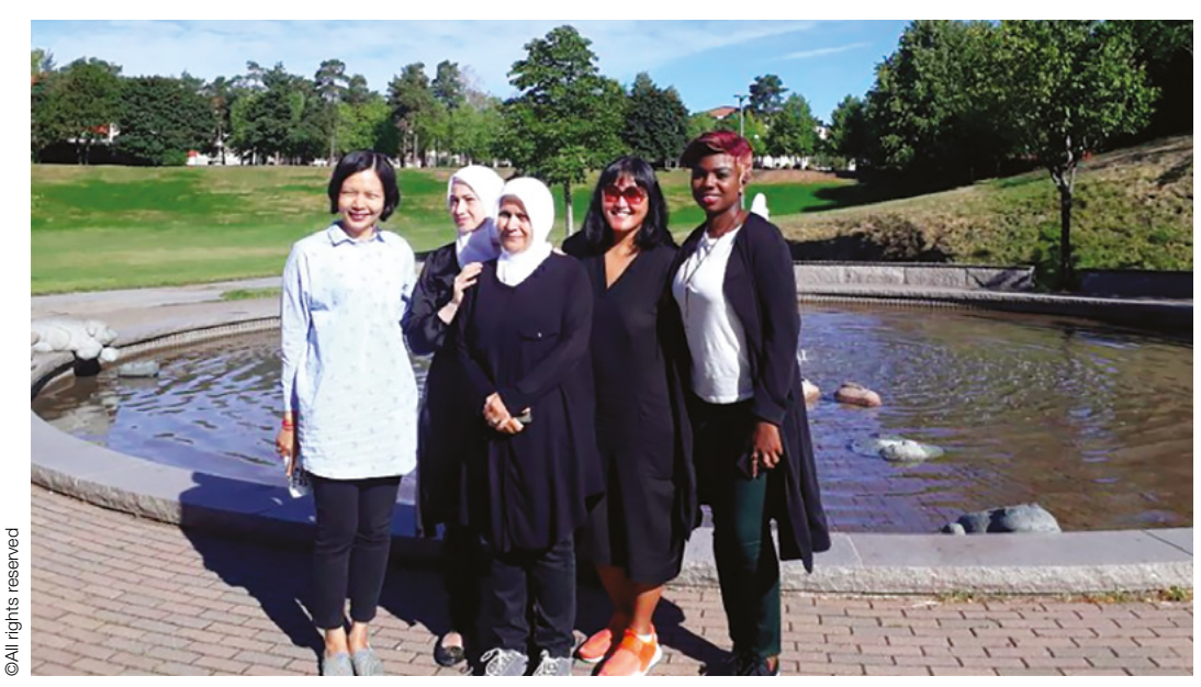
Women migrants in the Ester programme in Sweden (See case studies in the Annex).