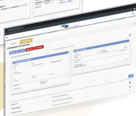
Electronic application form