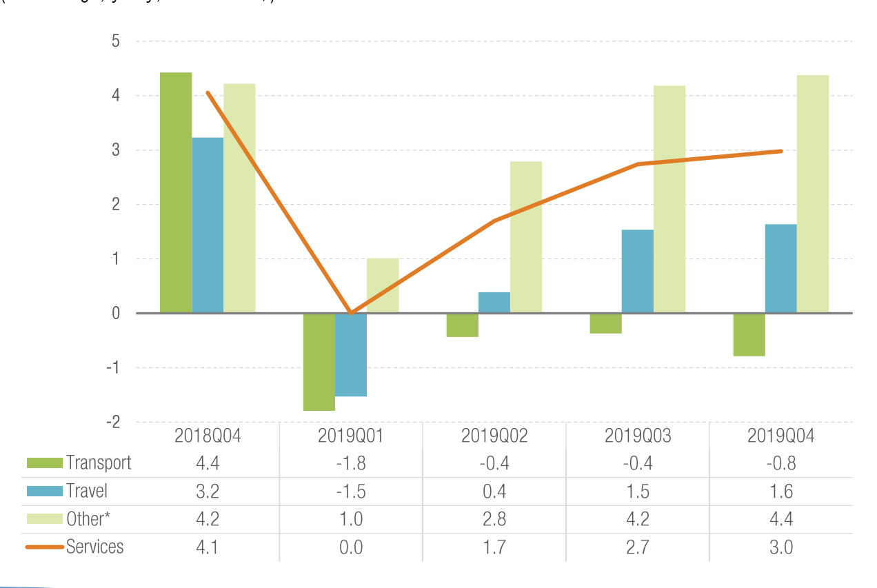
Figure 1. Global services exports growth rate (Percentage, y-o-y, current US$)