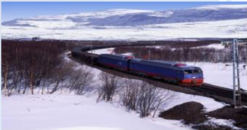
Transporting iron ore through Sweden

Contact information: For more information about UNCTAD iron ore publications please visit UNCTAD.ORG/commodities/iron ore (UNCTAD's IRON ORE project website) or write to ironore1@unctad.org .