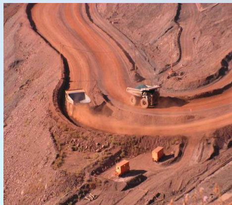
BHP Billiton iron ore operations at Mount Whaleback, Australia

The review on iron ore market developments (140 pages) is recognized as the most authoritative source of information on the iron ore market. The Report contains detailed reviews and data on iron ore production, trade, freight rates and prices, as well as an outlook for the eighteen months ahead.