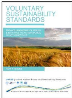
Flagship Report 1 Public Policy Issues and Objectives