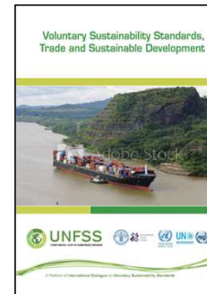
Flagship Report 3 VSS, Trade and Sustainable Development