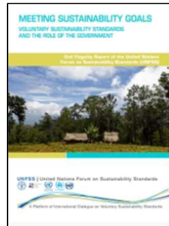
Flagship Report 2 VSS and the Role of the Government