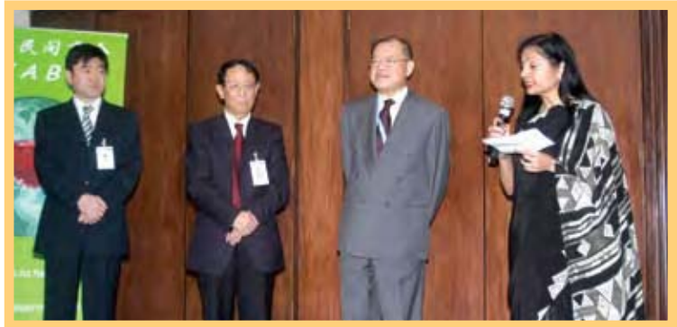
Launching UNCTAD's Investment Advisory Series during a CABC networking event.

A series of business networking events were organized, with the participation of more than 400 investors, IPAs and local business people as well as government officials dealing with investment and enterprise issues. The Business Networking Buffet Luncheon was sponsored by the China–Africa Business Council (CABC), while the Business Networking Dinner was sponsored by APEX-Brasil. The Ghana Investment Promotion Centre sponsored the WAIPA-Gala dinner.