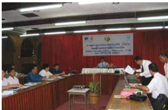
Training course in Lao People's Democratic Republic.