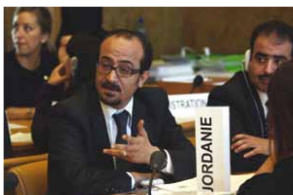
Discussion session at the short course in Geneva on “Energy in the twenty-first century: the emerging biofuels market and its development implications”, September 2009.

“The intensive courses enhanced my understanding on international trade issues; they have been very useful since I come from the Ministry of Planning and I had to ‘jump on the train’ with regard to WTO matters.”