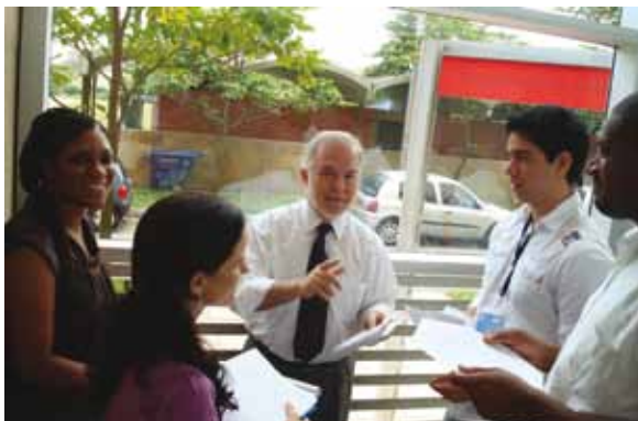
Participants at the Medellin course, 2009.

The Training Course on Key Issues on the International Economic Agenda, or Paragraph 166 course as it is also known, primarily targets policymakers – both in government ministries and agencies, and in permanent missions to the United Nations in Geneva. It has been delivered in two forms: (a) three-week regional courses for policymakers working in the government and academics; and (b) short (half-day) courses for Geneva-based diplomats.