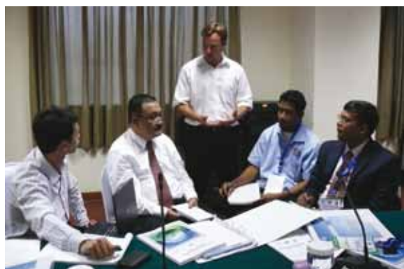
Participants at the Jakarta course, 2009.

Discussion session at the short course in Geneva on “Energy in the twenty-first century: the emerging biofuels market and its development implications”,