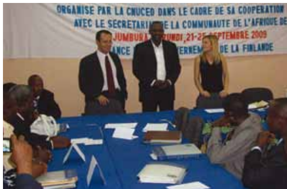
Training course in Burundi.

In Latin America and the Caribbean, the distance learning course on Legal Aspects of e-Commerce was delivered. The Study on Prospects for Harmonizing Cyberlaws in Latin America was published in June 2009 and will be translated in English in February 2010. A similar study for Central America and the Caribbean, based on the results of the 2009 workshop in San Salvador, is scheduled for publication in the first semester of 2010. The study provides a basis for advancing plans towards a harmonized legal framework to support the development of Internet-based commerce in countries of the Asociación Latinoamericana de Integración (ALADI). It presents a comparative review of the laws and bills of 11 ALADI member States in key policy areas and takes stock of regional ICT policy initiatives.