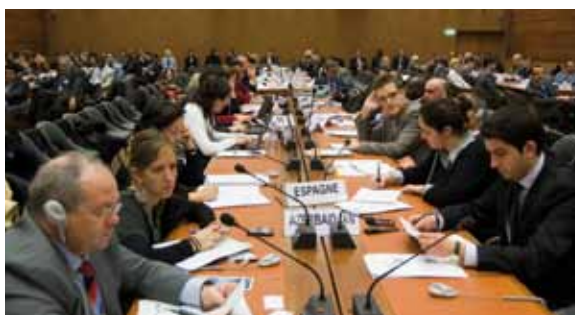
Multi-year Expert Meeting on Enterprise Development Policies and Capacity-Building in Science, Technology and Innovation, 20–22 January 2009, Geneva.

In many respects, the diffusion of ICTs continues to be a great development success story. During the past few years we have witnessed dramatic growth in the use of various ICT applications. Improved connectivity – especially through mobile phones – is enabling increased access to critical information. For firms, for instance, increased access to knowledge, business information and finance is a key factor for enhancing competitiveness. Nevertheless, huge gaps remain in many areas, both