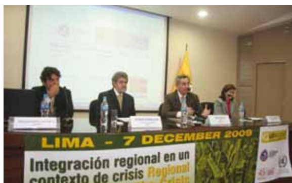
Regional integration workshop in Peru.

UNCTAD also continued facilitating the collaboration between Vi members in 2009. In May 2009, a fourth meeting of the network, attended by 32 university representatives, was held in Geneva. The meeting focused on research, in particular joint Vi research projects on the coffee sector in Colombia and Viet Nam, Qualified Industrial Zones in Egypt and Jordan, and regional integration in Latin America.