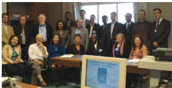
Ad-hoc expert meeting on 12–13 November 2009, Geneva.

During the last quarter of 2009, preparations began for the IER 2010 , the theme of which will be ICTs, enterprises and poverty alleviation. In this context, an ad hoc expert meeting was held in Geneva 12–13 November 2009, gathering representatives from academia, international organizations, government, civil society and the private sector. Discussions focused on how the production and use of ICTs by enterprises can contribute to reducing substantively negative aspects of poverty. The meeting brought new insights, experiences and viewpoints from different countries and institutions working in the area of ICT for development. It also provided an opportunity for networking between UNCTAD and the community of ICT experts.