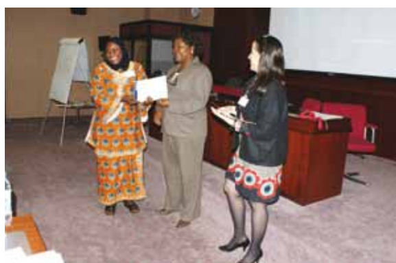
Training course in Addis Ababa, Ethiopia.