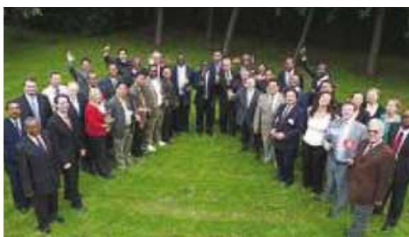
Participants of the course in Malaysia.

In 2009, the network grew from 28 to 31 countries, including 7 new members from Brazil, Colombia, Ethiopia, Mexico, Switzerland and Viet Nam. At the end of the year, the Vi university network consisted of 51 universities. A map is presented in annex II showing all countries member of the Vi. See also: http://vi.unctad.org .