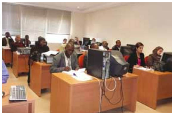
Training course in Rabat, Morocco.