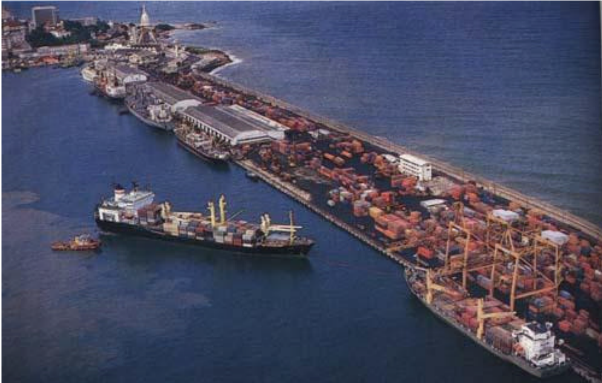
PORT OF COLOMBO – QCT THE BIRTHPLACE OF CONTAINERIZATION