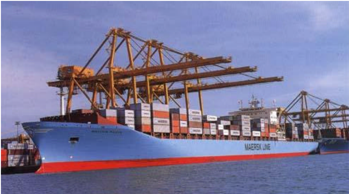
PORT OF COLOMBO – JAYE CONTAINER TERMINAL