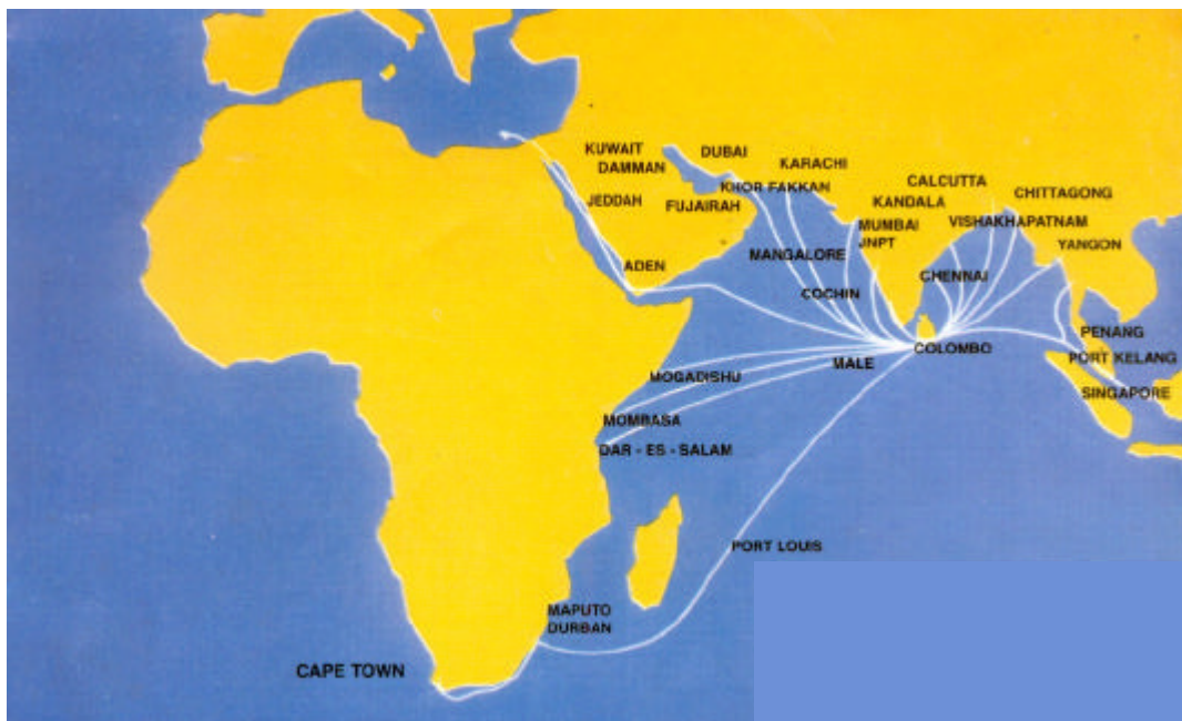
Figure 1. Position of the Port of Colombo