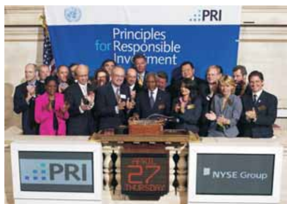
United Nations Secretary-General Kofi Annan opening the New York Stock Exchange on 27 April 2006.

Initiative (UNEP FI) and the UN Global Compact.