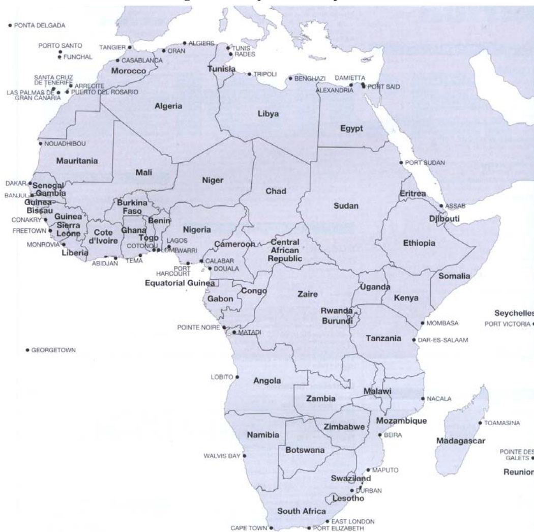
Figure 1: Major African ports