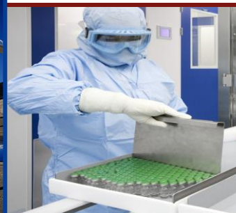
Chemical products and pharmaceuticals