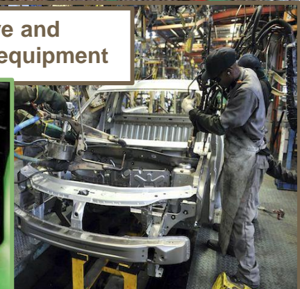
Automotive and transport equipment