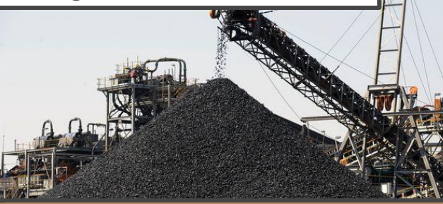
Mining and mineral beneficiation