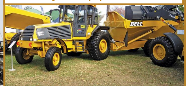
Machinery and equipment