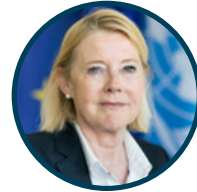
H.E. Amb. Lotte KNUDSEN

Permanent Representative of the United States to the UN Office at Geneva