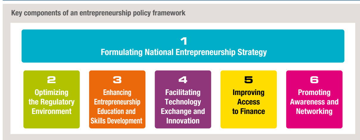
Figure 2. UNCTAD's Entrepreneurship Policy Framework

This document offers guidance on the specific issues that require examination and assessment under each area. It identifies selected policy options that will enable policymakers to begin the strategy formulation process, and it proposes checklists and numerous references in the form of case studies and best practices that provide further guidance on