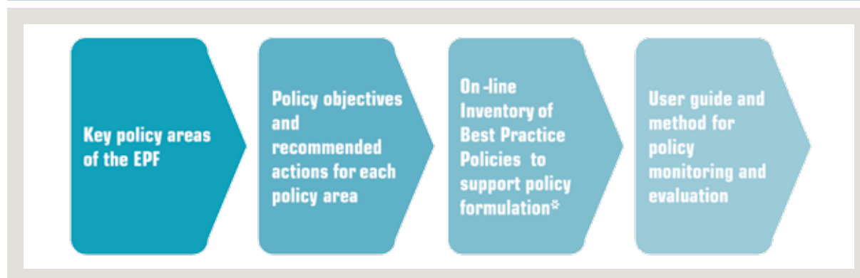
Figure 3. Structure of UNCTAD’s Entrepreneurship Policy Framework and Entrepreneurship Policy Toolkit

The policy framework and its toolkit elements include the work of four UNCTAD Inter-governmental Multi-Year Expert Meetings held from January 2009 to January 2012 as well as a series of international expert meetings organized by the Secretariat. It represents a baseline document for UNCTAD to assist policymakers in evaluating the state of entrepreneurship in a specific country, and to make sound policy recommendations. It is also meant to serve as a useful document to foster policy dialogue on entrepreneurship. In order to accommodate suggestions and improvements that may result from such dialogue, the Entrepreneurship Policy Framework has been designed as a “living document”. UNCTAD will aim continuously to integrate learning from technical assistance work on entrepreneurship development. Finally, the online inventory of best practice policies will provide the opportunity for all stakeholders to contribute cases, examples, comments and suggestions, as a basis for the inclusive development of future entrepreneurship policies.