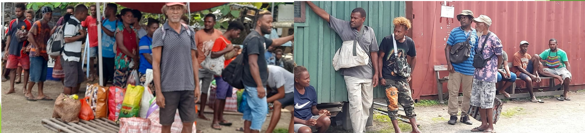
Most Thavakua farmers waiting for their payment as VHL Accounts sort out their payment the same day.