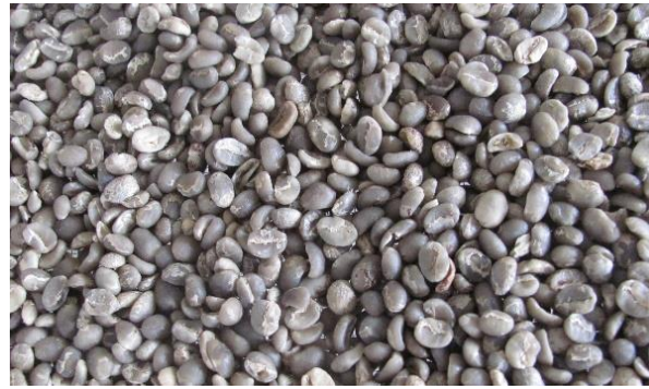
Dry Coffee with Patchment & Beans