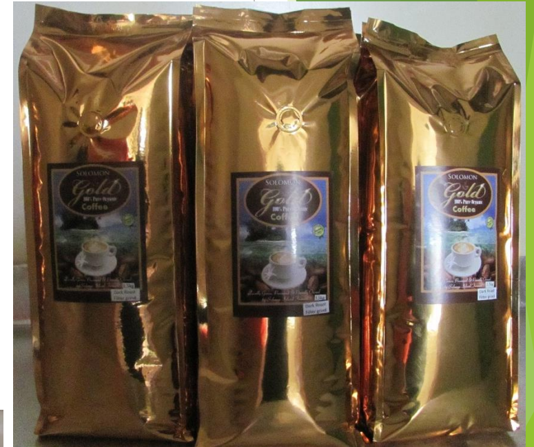
1.5kg Arabica Roast Coffee