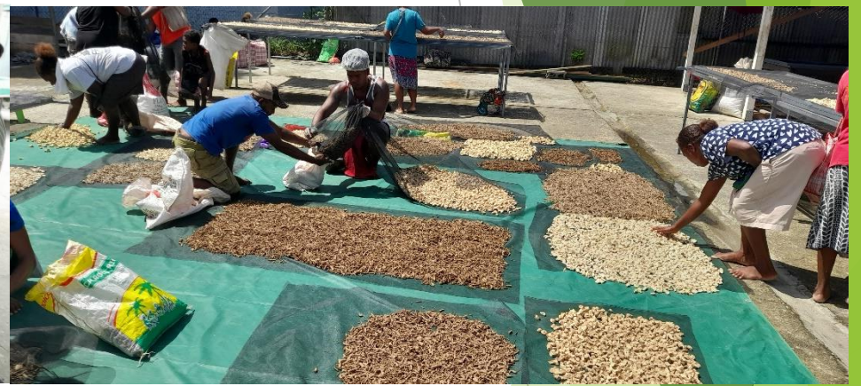
Sun-drying of Thavakua