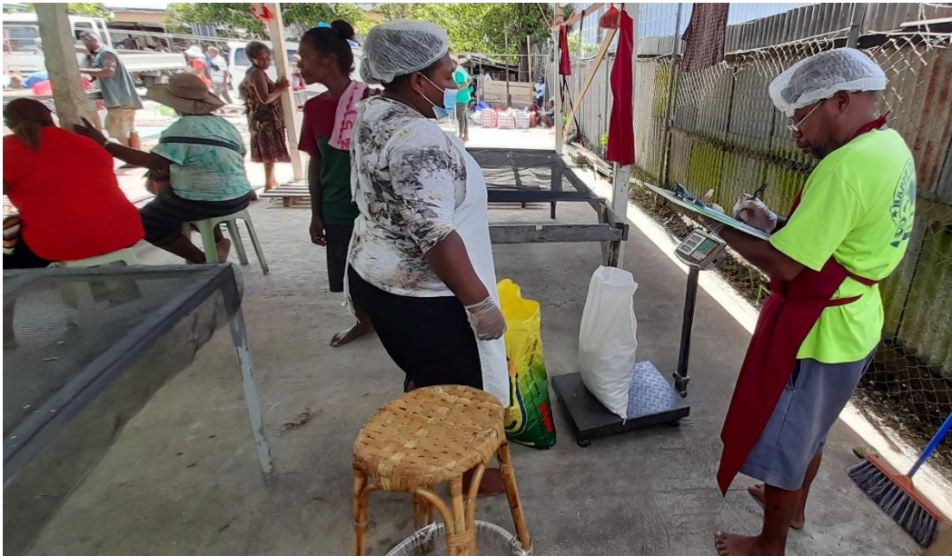
Scaling of farmers well dried Thavakua