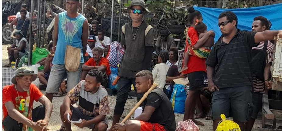
Farmers waiting Area