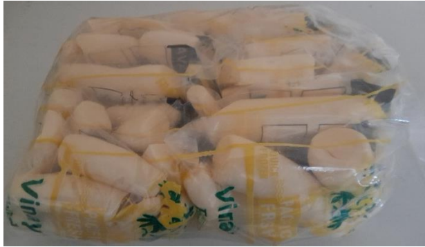
10kg Yellow Cassava bag