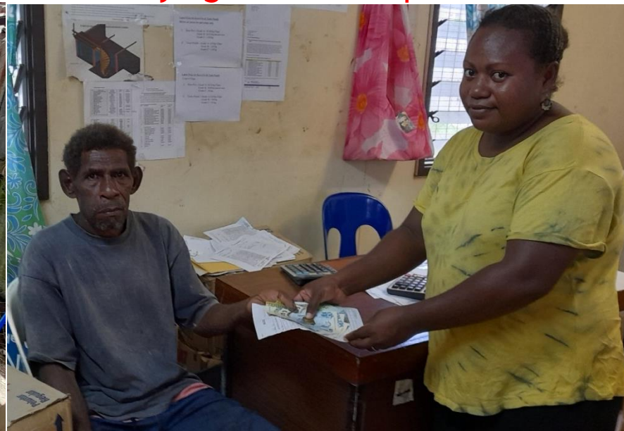
Thavakua farmer receive his payment