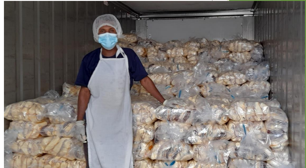
Frozen Cassava bags on staking