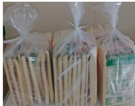
10kg Cassava Grated