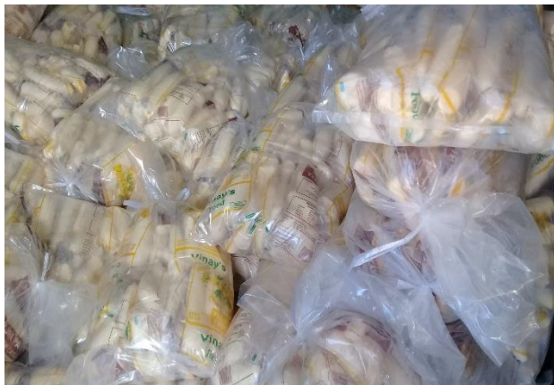
10kg Cassava bags