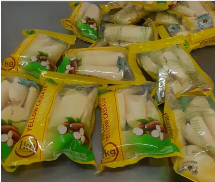
1kg Yellow Cassava Packets