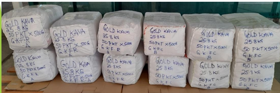
25pkts x 25kg bags of Thavakua powder