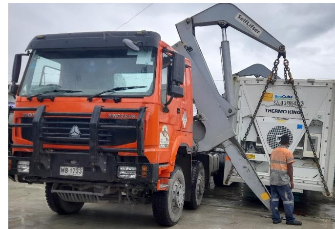
Reefer Container left to Port