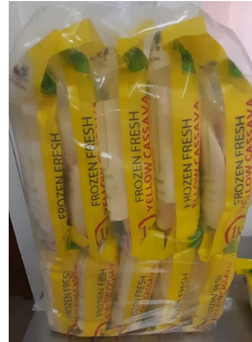
10kg Yellow Cassava bag