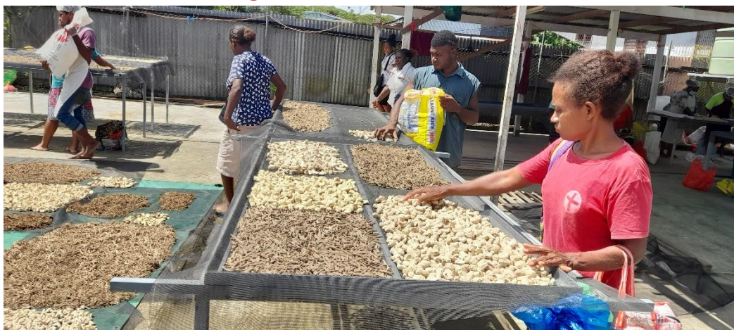
Re-sun drying to meet required Moisture Content