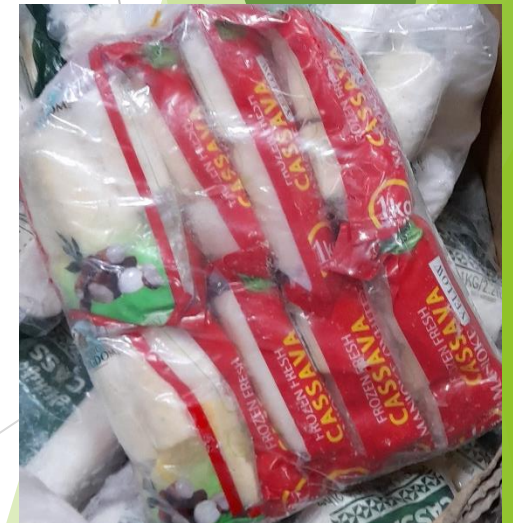
10kg White Cassava bag