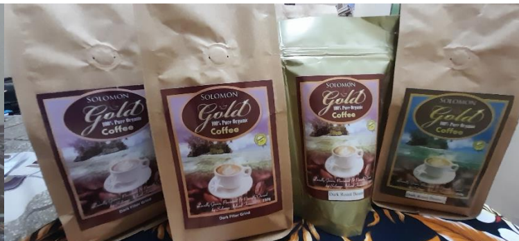
250gm Dark Roast Grind Coffee