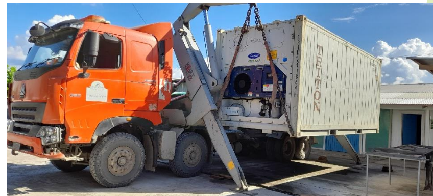
15.6MT of yellow Manioc