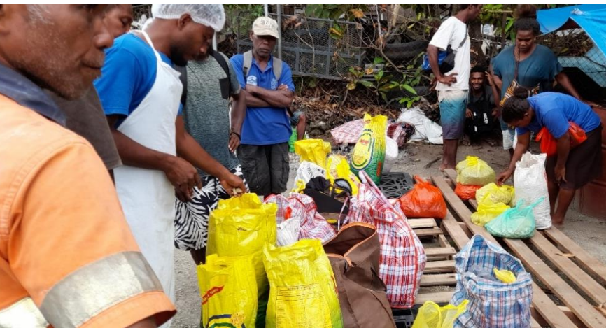
Staffs checking Moisture content