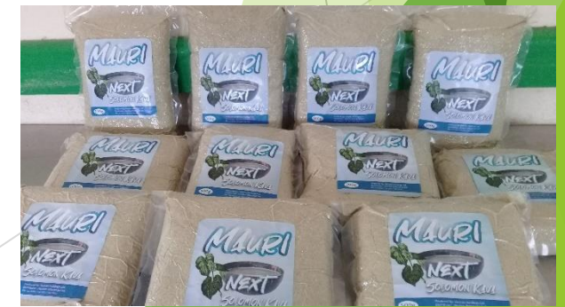
500g packages (Kiribati)