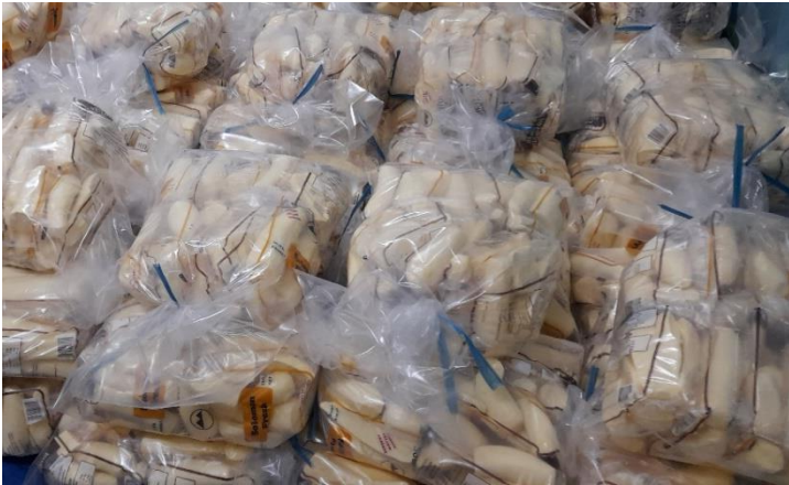
10kg Yellow Cassava bags