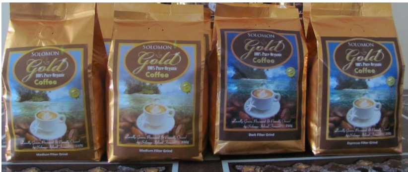
250gm Dark Roast Coffee