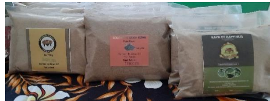
100g packages (Local Sales)