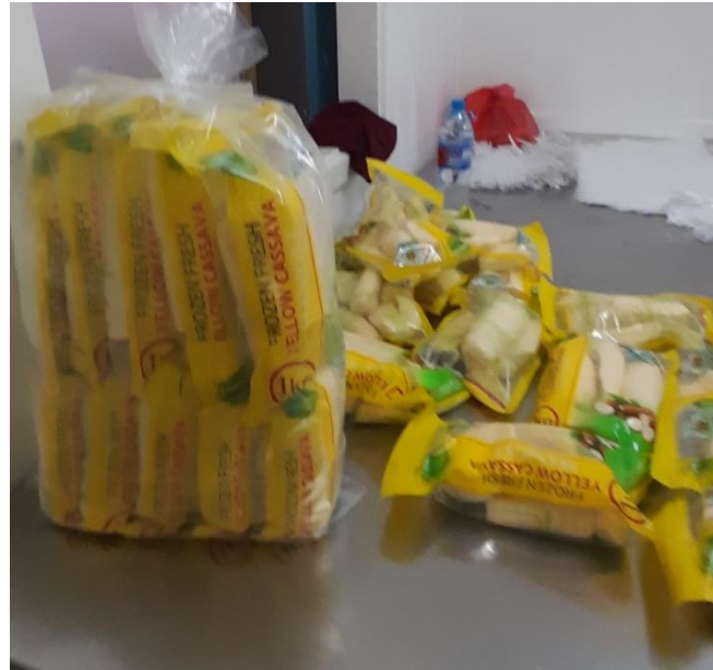
10kg Yellow Cassava bag