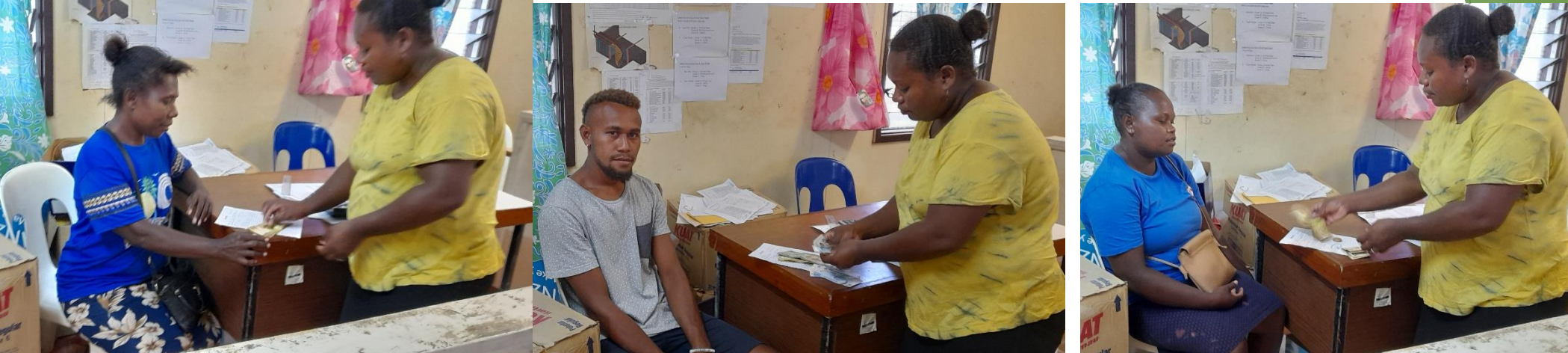
Thavakua farmers received their payment from VHL Accounts Office