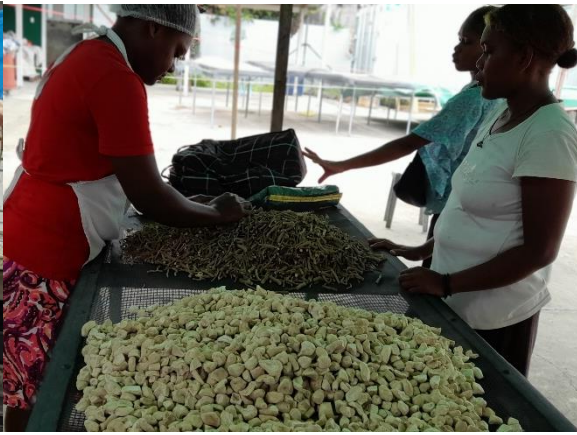
Staff Grading the Thavakua