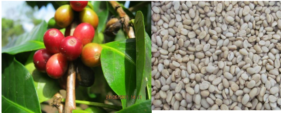
Arabica Coffee Ripe Cherries