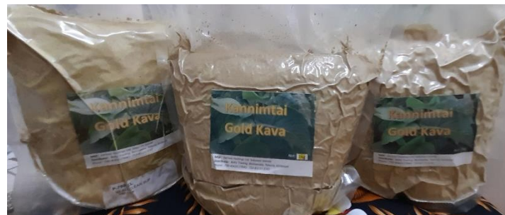
1kg & 500gms packages (Kiribati)