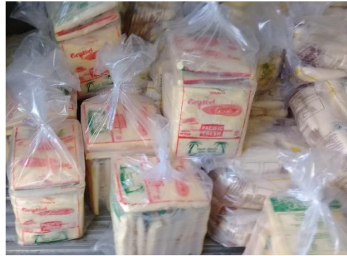
10kg Cassava Grated bags Filled with bags of Frozen cassava