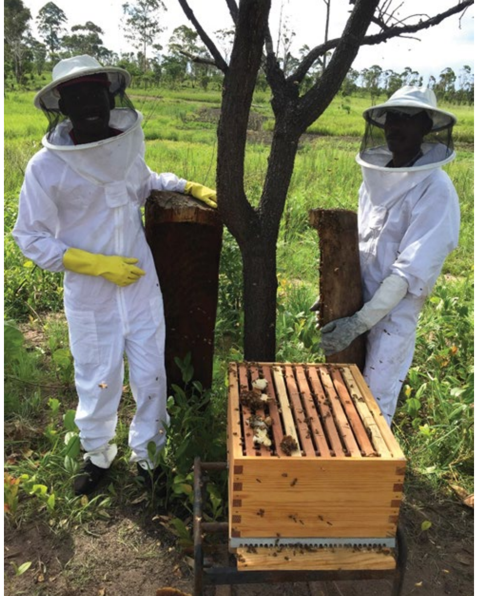
Beekeepers in Kalima.

For a country that relies on oil for nearly 94 percent of its export earnings, the current focus on honey production