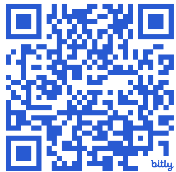
FFEM at a glance