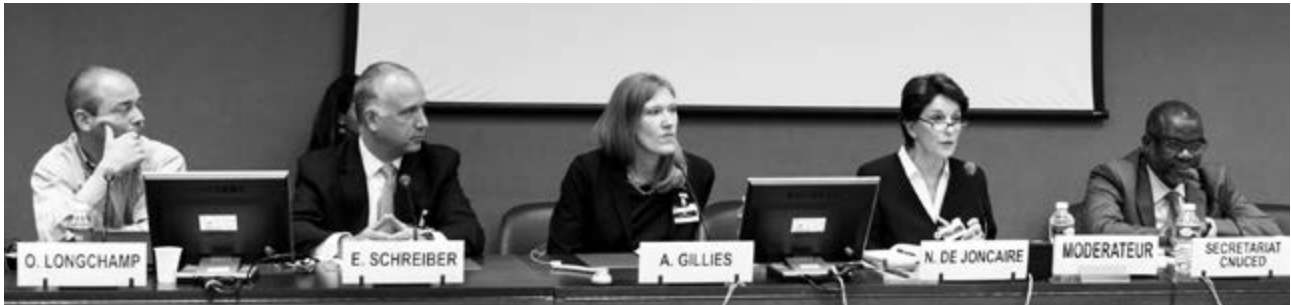
Plenary session 4 - Panel

by many uncoordinated international accountability mechanisms that can contribute to “image laundering,” involving compliance with reporting guidelines that are narrowly focused on commercial transactions, but do not address larger human rights concerns. Going beyond image laundering may involve broadening transparency standards to include human rights, for example demonstrating zero tolerance for child labour along the entire value chain.