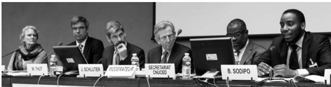
Plenary session 3 - Panel

More generally, there is often confusion between "transparency" and "accountability" in relation to commodity-based activities. This confusion is reinforced