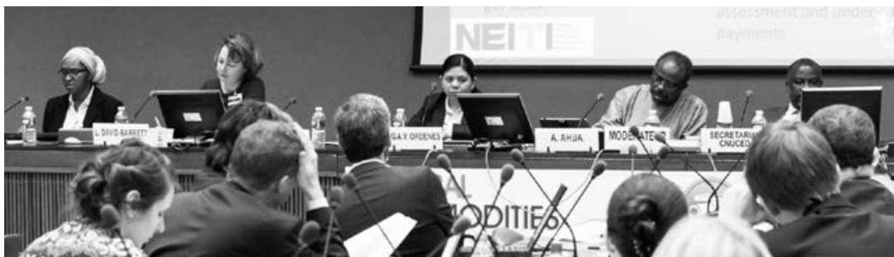
Plenary session 5 - Panel

But these political discussions are only possible if the country has: a) a critical mass of intermediaries - for example, citizens and civil society organizations (CSOs) - who are capable of accessing and evaluating the data; and b) a relative freedom of expression. Absent these factors, even a robust EITI programme has no channel by which to contribute to the fight against corruption. Indeed, in recent years the EITI has increased its focus on civil society, both as part of the EITI Standard, 7 and with capacity-building training programmes, responding to criticism that the early versions of the EITI Standard paid too little attention to the importance of an empowered civil society.