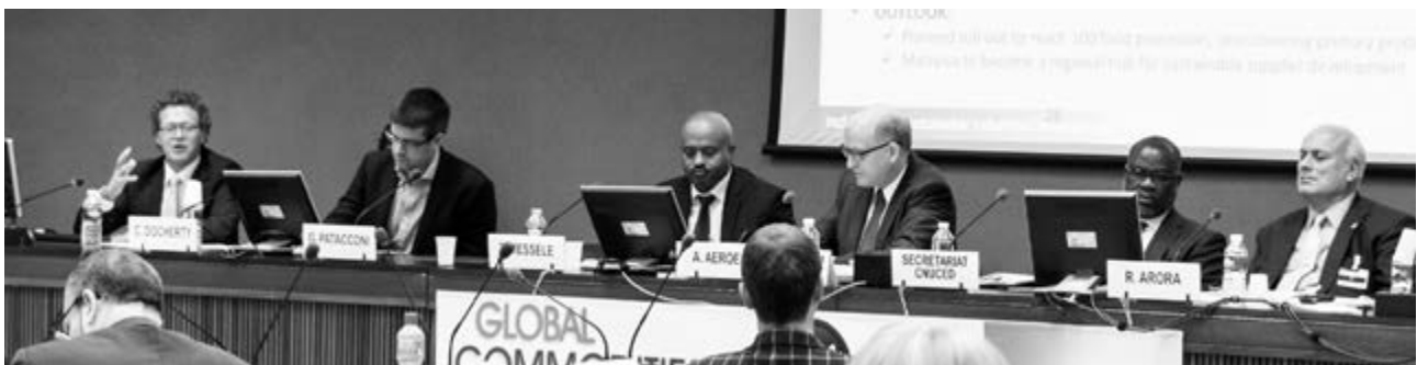
Plenary session 2 - Panel

In Africa, the stakeholders in the cotton value chain have collaborated to resurrect the fortunes of the continent’s cotton sector. African cotton producers face significant competitive challenges when trying to access consumer markets, not the least of which is a value chain that is