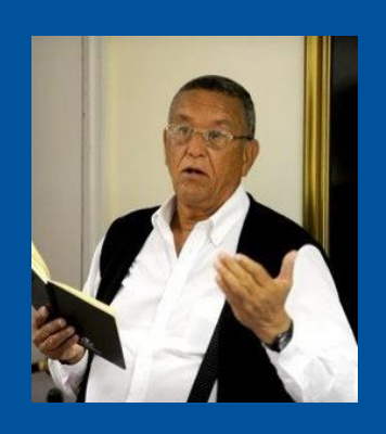
Cecil le FLEUR National Khoi and San Council of South Africa