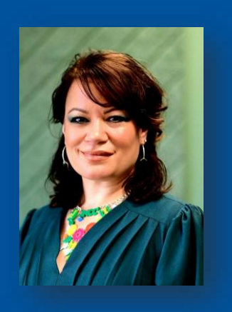
Joint Nature Conservation Committee