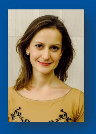
Svetlana CHOBANOVA WTO

12:10-12:50: Session 5 World Trade Organization (WTO)