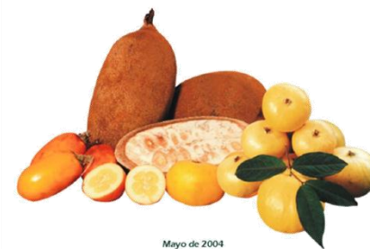
Mayo de 2004