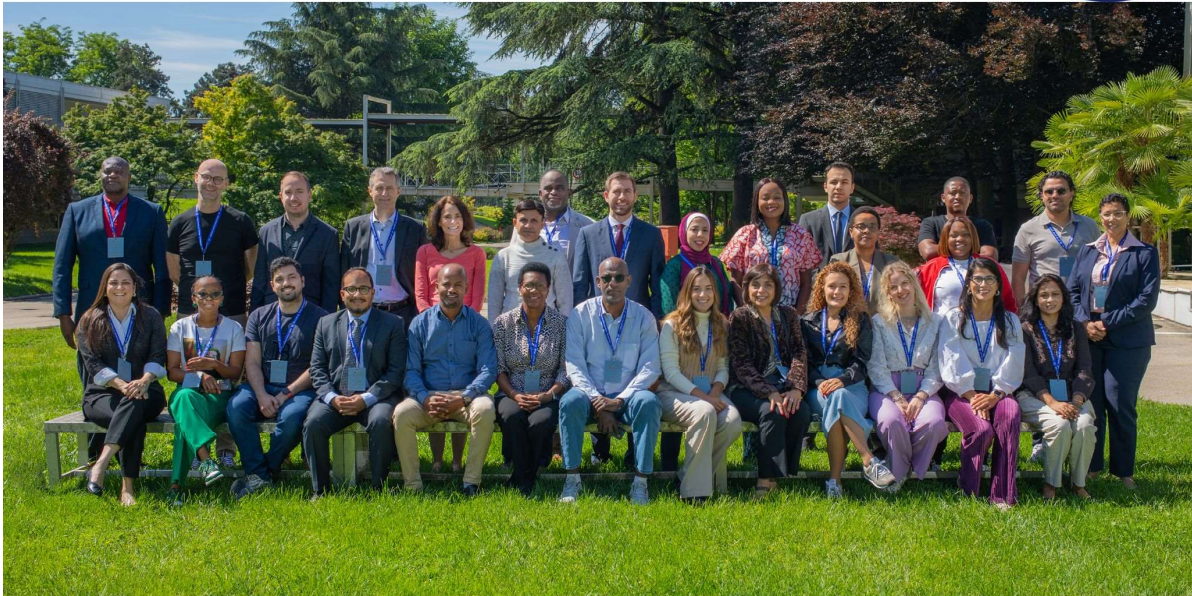
Effective investment facilitation and sustainable development

A9017195 – Turin (Italy), 27-31 May 2024