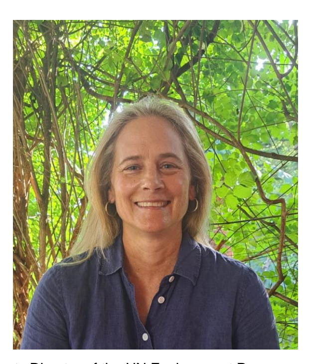
Melissa De Kock , Deputy Director of the UN Environment Programme World Conservation Monitoring Centre (UNEP-WCMC)

24 October 2024, 9 – 17:30 (COT) - UN Hub, Place Quebec (Blue Zone)