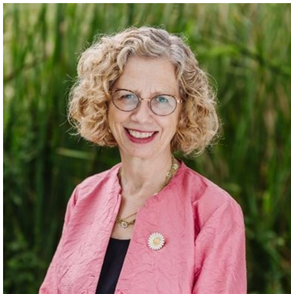
Inger Andersen , Executive Director, UNEP

KMGBF Pavilion, Centro de Eventos Valle Del Pacífico (CEVP)