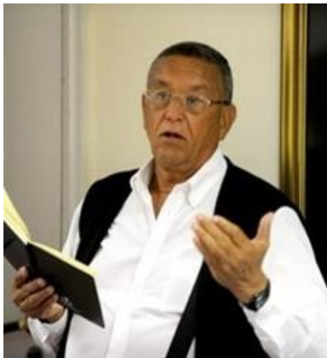
Cecil le Fleur , Chairperson, National Khoi and San Council, South Africa

Trade, biodiversity and circular economy