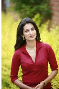
Ms. Nisha Pillai , Journalist

Nisha Pillai is an accomplished news presenter who worked with the BBC World News for 25 years. Her areas of expertise span a wide range of subjects including economics, finance, IT and the energy sectors. She is also adept at covering health and social issues and has worked closely with several UN agencies such as UNICEF, UNIDO and UNAIDS. Nisha enjoyed a twenty five-year career at the BBC as a news anchor and investigative reporter. For several years, she was one of the main news anchors at BBC World News and fronted the acclaimed programme, Asia Today . She was awarded the Royal Television Society's Award for best current affairs programme for 'The Max Factor' – her investigation into the late media tycoon Robert Maxwell's sprawling business empire, which was broadcast a month before his death. Nisha was also one of the first regular interviewers on Hard Talk , the BBC's half-hour long interview programme.